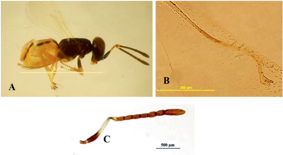
Fig 3. Charitopus sp.: A. Female (lateral view), B. Forewing venation, C. Antenna of female