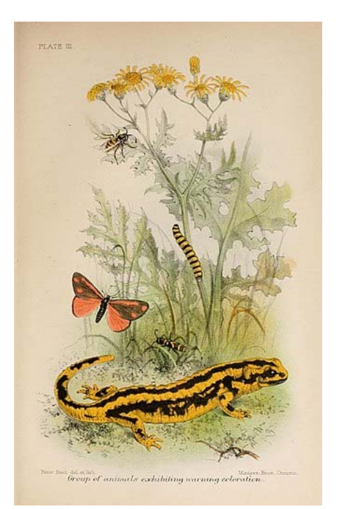
Plate III, "Group of animals exhibiting warning coloration", from Animal coloration (1892)