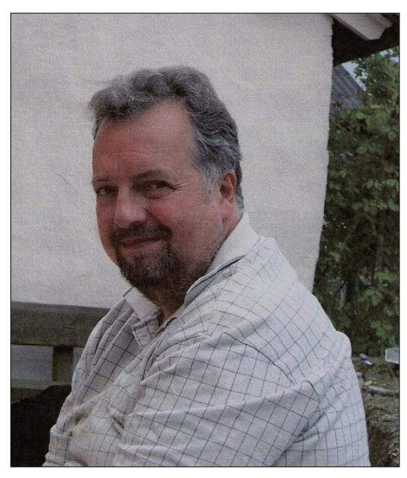
Figure 1. Marc Meyer 2006 (photo: C. Harbusch).

Received 19 March 2016; accepted 4 April 2016; published: 18 April 2016 Subject Editor: Jadranka Rota.