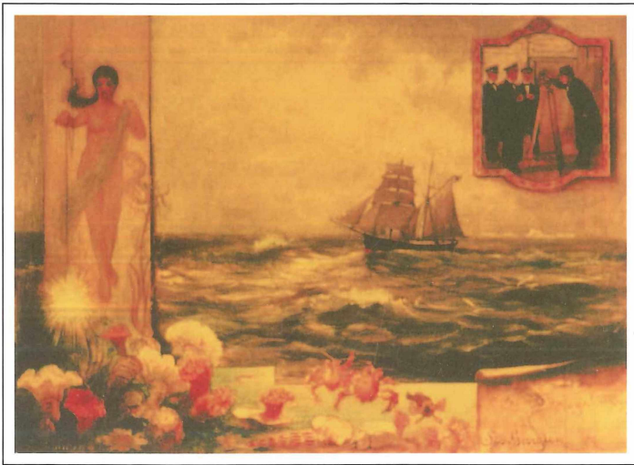
Fig. 3: Watercolour-picture to the 1 st international polar-year 1882/83. The painting shows the corvette "Moltke", which took the expedition from South America to South Georgia. (Right up: Georg von Neumayer teaches the participants of the South-Georgia-expedition.)

The polar archives are primarily used by visitors of the museum and by members of POLLICHIA, but also by pupils, students and scientists in quest of material far from the big institutes. Of course, the archives are also available to people from all parts of the world.