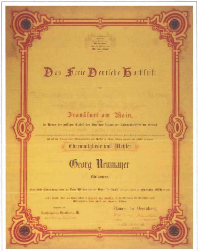
Fig. 2: Neumayer's appointment as "Ehrenmitglied und Meister" by "Freies Deutsches Hochstift", Frankfurt/Main

In accordance with the function of a museum the library also contains popular literature. However, in order to save space, a special collection of 300 children's books on polar-themes was given to the Georg-von-Neumayer school in Neumayer's native town Kirchheimbollen as a permanent loan.