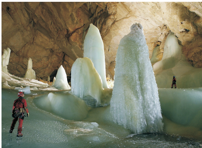
Schneevulkanhalle in der Schwarzmooskogel-Eishöhle

Euro pro Band verbindlich vorbestellt werden (nur so lange der Vorrat reicht).