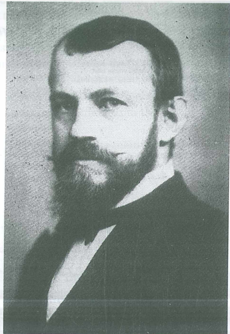
Ernst Weinschenk (born) Esslingen 1865; (died) München 1921

For this thesis of paragenesis Weinschenk mainly collected specimens in the Bavarian Forest and the Alps. He was able to travel to the Alps from Munich by train as early as 1889.