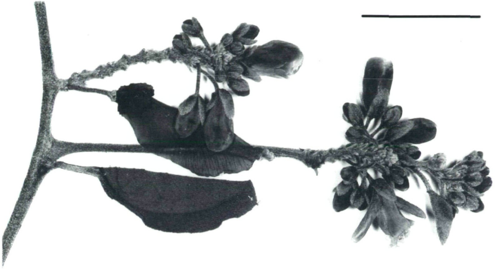
Fig. 3: Partial-Inflorescence of Securidaca dolod (from Wallnöfer 11-8488). Bar = 1 cm.