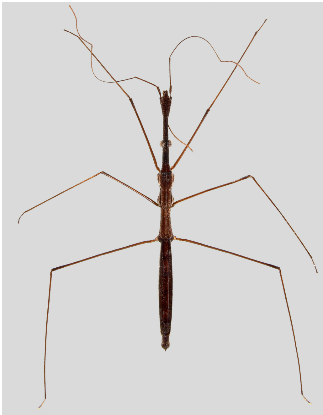
Fig. 1: Habitus of the holotype of Hydrometra balkei sp.n.

– 90, protarsus – 2+8+6, mesofemur – 84, mesotibia – 100, mesotarsus – 2+8+6, metafe- mur – 106, metatibia – 132; metatarsus – 2+7+6. Mesotibia length 5.9 times mesotarsus length. Second mesotarsomere 1.4 times as long as third.