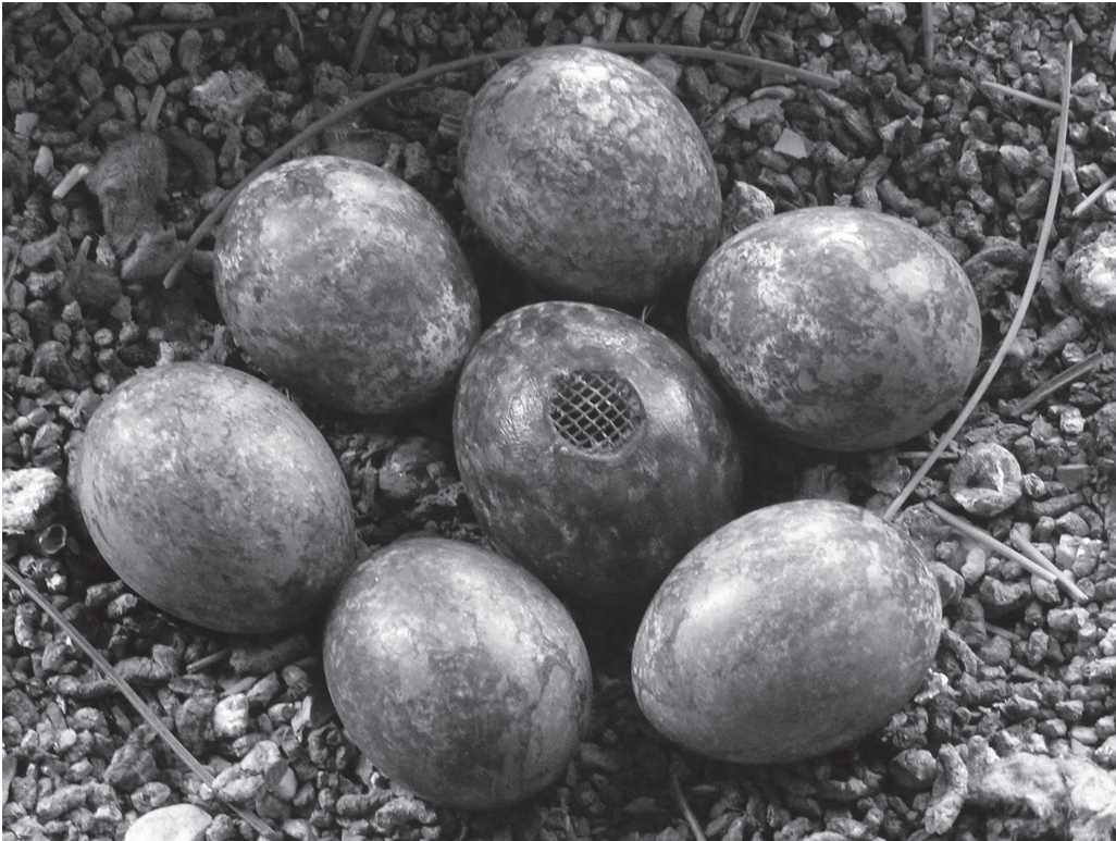
Fig. 2: An artificial egg prepared with a blood-sucking bug placed in the middle of a complete Kestrel clutch (6 eggs) in a building cavity in Vienna, Austria.

-20°C. We also sampled 154 Kestrel chicks by puncturing the brachial vein ("conventional method"). Although the bugs add the protein dipetalogastin as an anticoagulant (LANGE et al. 1999), we stored all samples in EDTA-coated tubes to be able to use the same DNA extraction protocol.