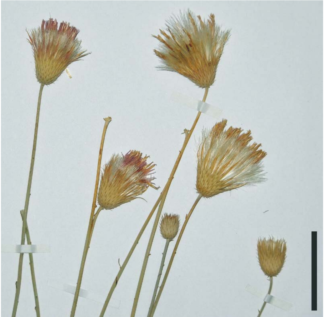
Fig. 2: Old and alive heads belonging to Tricholepis gedrosiaca (former T. edmondsonii ), Mirtadzadini 1282 (MIR). Scale bar = 3 cm.