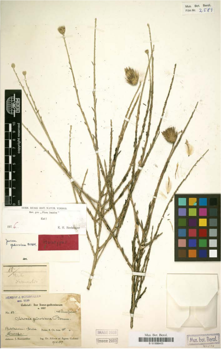
Fig. 1: Holotype specimen of Tricholepis gedrosiaca (former Jurinea gedrosiaca ), photo from BGBM online database.