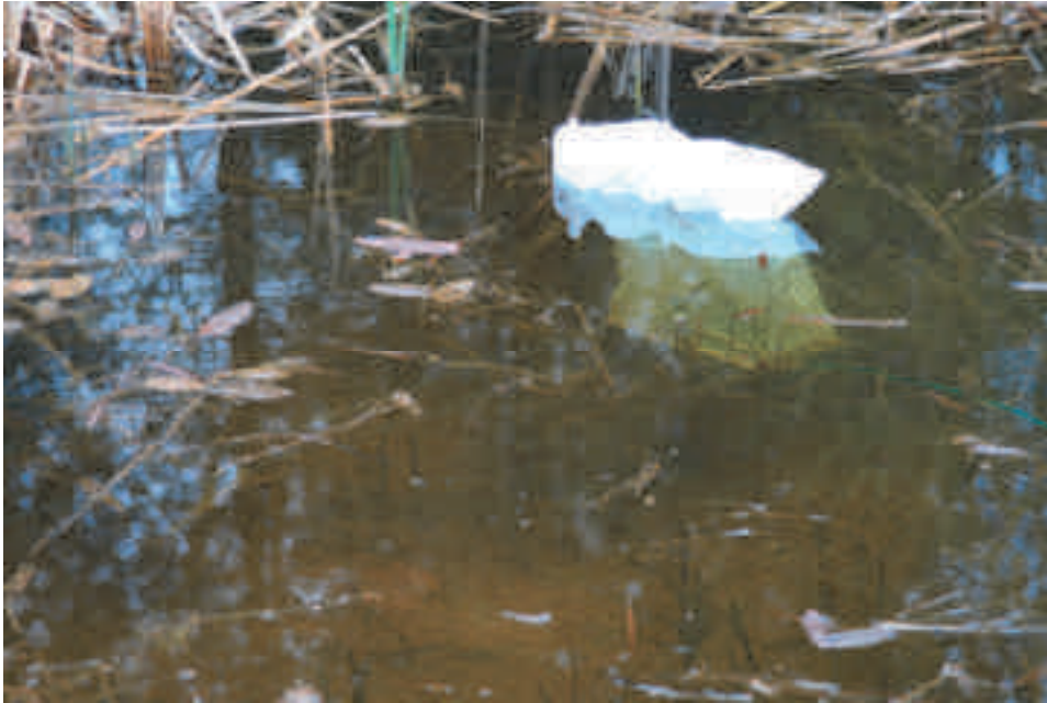
Figure 4b: Newt trap deployed. Abb. 4b: Ausgelegte Molchfalle.

3. Toss the trap assembly out to the desired spot, trying to make it land upright. (Not essential) Allow for 'wind drift' during sinking if necessary. Wait for the box to sink fully (fig. 4b), wind in all slack line and secure the winder in the bank-side vegetation. Submerge the line as much as possible to keep human attention to a minimum. Check as far as possible that the box is not floating off the bottom.