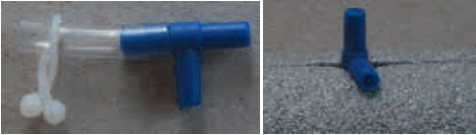
Figure 3a and b: Breathing tube assembled and inserted into the float. Abb. 3a und b: Zusammengesetztes und in den Schwimmer eingesetztes Atmungsrohr.