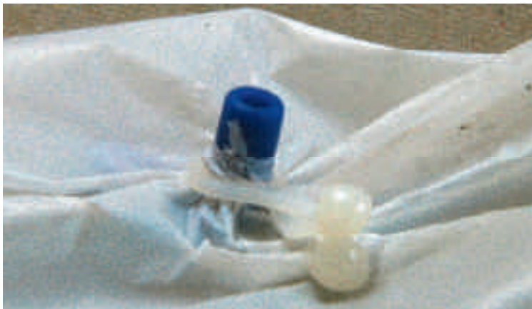
Figure 3c: Breathing tube and float inserted into bag and secured by clip. Abb. 3c: Atmungsrohr und Schwimmer sind in den Beutel eingesetzt und mit einem Clip befestigt.

Attach the loop of elastic around the box assembly approximately half way down. Place the open end of the bag over the box and secure it with the elastic ensuring that it is securely fastened all the way round. Push the elastic firmly up against the box rim to ensure that the bag will not become detached during deployment. An excessive amount of the bag should not be allowed to obstruct the trap opening (fig 3d.)