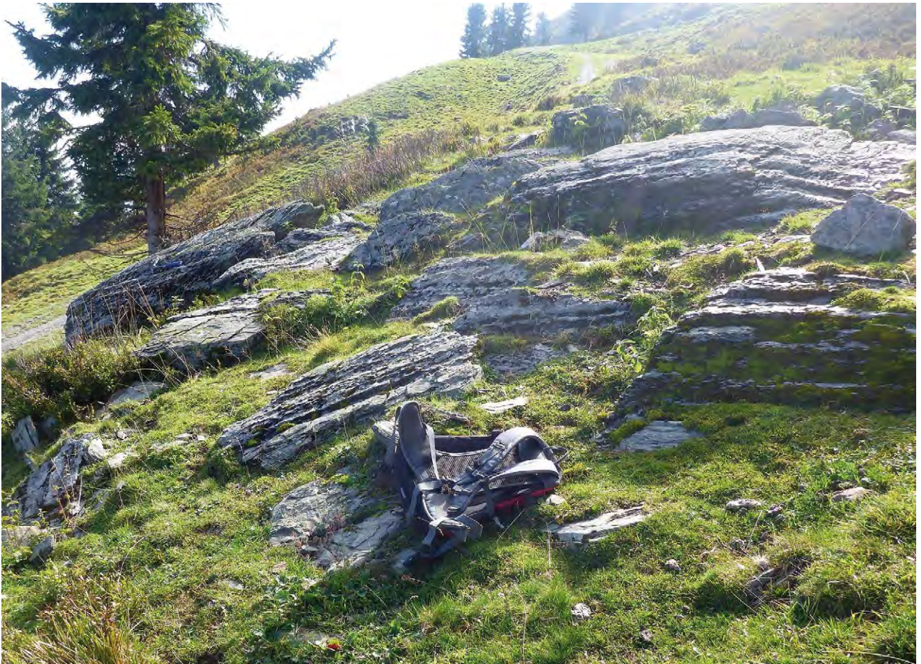
View of blocks of the Kirchbach Formation near Kirchbacher Wipfel Alm.