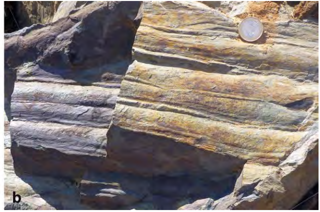
Views of the Kirchbach Formation in the field. a) typical aspect of the Kirchbach Formation, outcrop near Kirchbacher Wipfel Alm; b) remains of Archaeocalamites sp. in a limestone block near Kirchbacher Wipfel Alm.