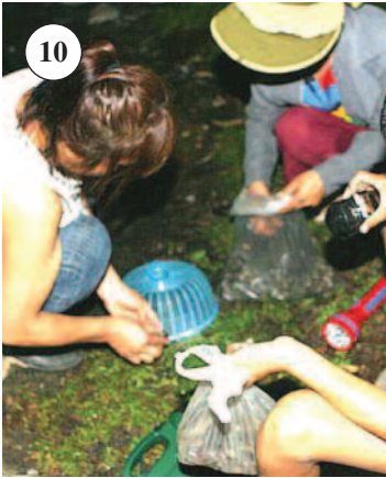
Fig. 10 (from VDO): Estimate of cigalicid bags; in each of them, several hundred, even more than a thousand agonizing males.

Michel Boulard: Platylomia operculata Distant, 1913, a cicada that takes water from hot springs and becomes victim of the people