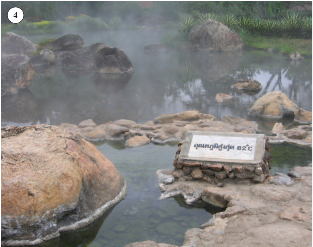
Figs. 3 & 4: Jaesorn N.P. Panoramic views of the "thermal springs", often clouded with very slightly sulphurized vapours.

Michel Boulard: Platylomia operculata Distant, 1913, a cicada that takes water from hot springs and becomes victim of the people