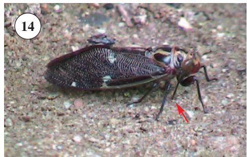
Figs. 13 & 14: Leptopsaltria sp. (in description) on mud (13, from VDO) and Balanta tenebricosa Distant, on humific sand (14), two species encountered near the same hot springs during the day, and accustomed to drink (see arrow) water more or less charged with mineral salts, but also with different organic molecules. The evidence of this: the yellowish colour of urine which, every 7 to 9 seconds, Leptopsaltria ejected with spectacular micturations (see arrow). It should be emphasised that the specimens encountered were also males!