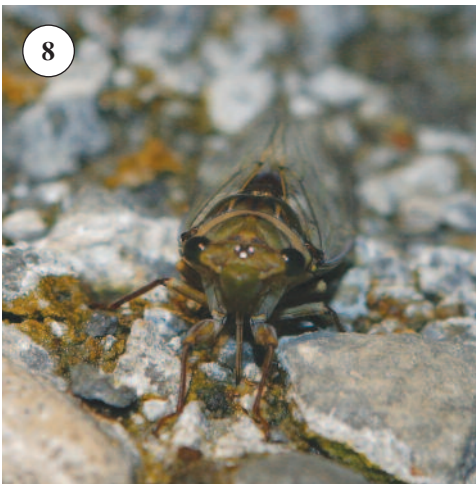
Figs. 6 to 9: Platylomia operculata Distant. Close-up of the "cicadas taking the waters". 6 , "birds' eye" view of two males which have fallen on the rocky bed of the springs. 7 , subfrontal view of one of the males drinking between damp stones. 8 , frontal view of a male, its rostrum perpendicularly planted between wet stones; 9 (from VDO), in spite of the postclypeus being crushed by a supposed collision with a rock "during a badly calculated landing" this male drinks, the rostrum is kept on the lateral fringe of the spring near which the cicada alighted.