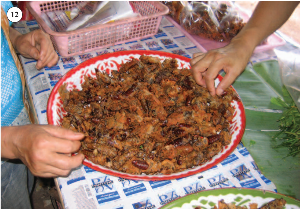
Figs. 11 & 12: On a neighbouring market, sale of fricassée cicadas offered in voluminous dishes. In 11, Kwankanok Chueata (to the left) speaking with the saleswoman; in 12, close-up view of one of the baked cicada dishes.