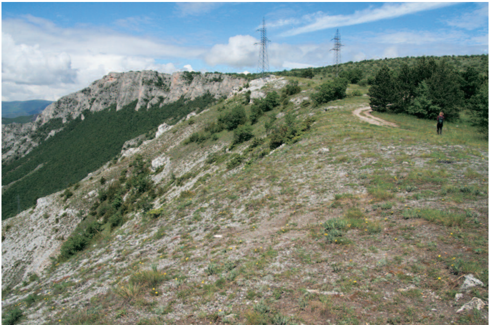
Figure 4. The ridge above Kozjak Lake is one of the butterfly richest places in Macedonia with several rare species like Euchloe penia , Euphydryas aurinia , and Muschampia cribrellum present.

- Cupido osiris – Known only from Ohrid region, Šar Planina Mts. and two squares in SE Macedonia (Schaidler & Jakšić 1989). This is clearly an underrepresentation of the range of this species in Macedonia. Actually this species was among