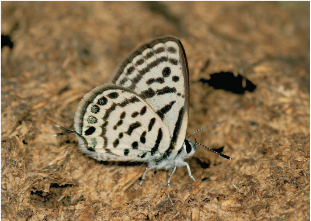
Figure 3. Tarucus balkanicus was found at several new sites in Macedonia.

Slika 3. Tarucus balkanicus je bil najden na nekaj novih lokalitetah v Makedoniji.