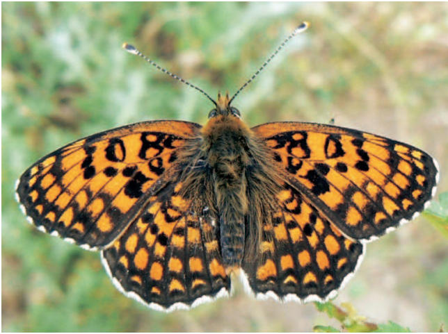
Figure 2. Melitaea telona , a new species of the fauna of the Republic of Macedonia.