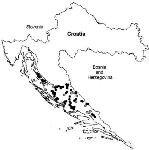
Fig. 1. Distribution of Dalmatian Ringlet ( P. afra dalmata ) in Croatia. Grey spots represent old records, black spots represent new ones.

T. Koren, I. Burić, A. Štih, V. Zakšek, R. Verovnik: New data about the distribution and altitudinal span of the Dalmatian ringlet