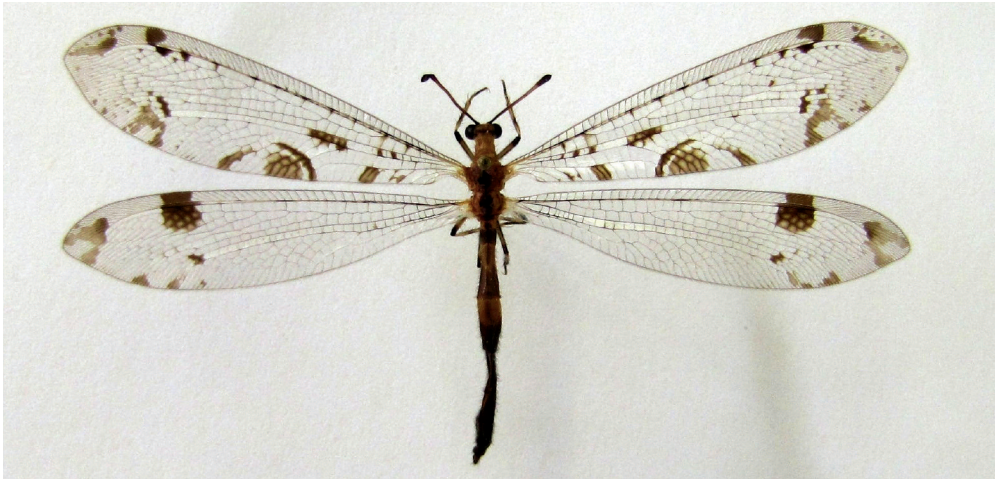
Fig. 1: Dendroleon pantherinus (Fabricius, 1787).