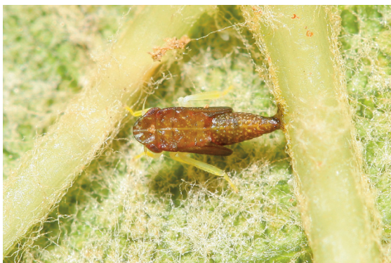
Fig. 4: E. vulnerata – nymph Sl. 4: E. vulnerata – nimfa