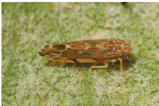
Fig. 3: Erasmoneura vulnerata – imago Sl. 3: Erasmoneura vulnerata – odrasla žival