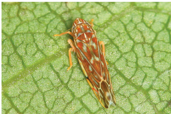
Fig. 2: Erasmoneura vulnerata – imago Sl. 2: Erasmoneura vulnerata – odrasla žival