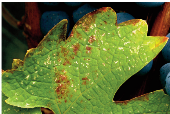
Fig. 5: E. vulnerata – speckled lesions on grapevine leaves.

Sl. 5: E. vulnerata – točkaste poškodbe na listih vinske trte.