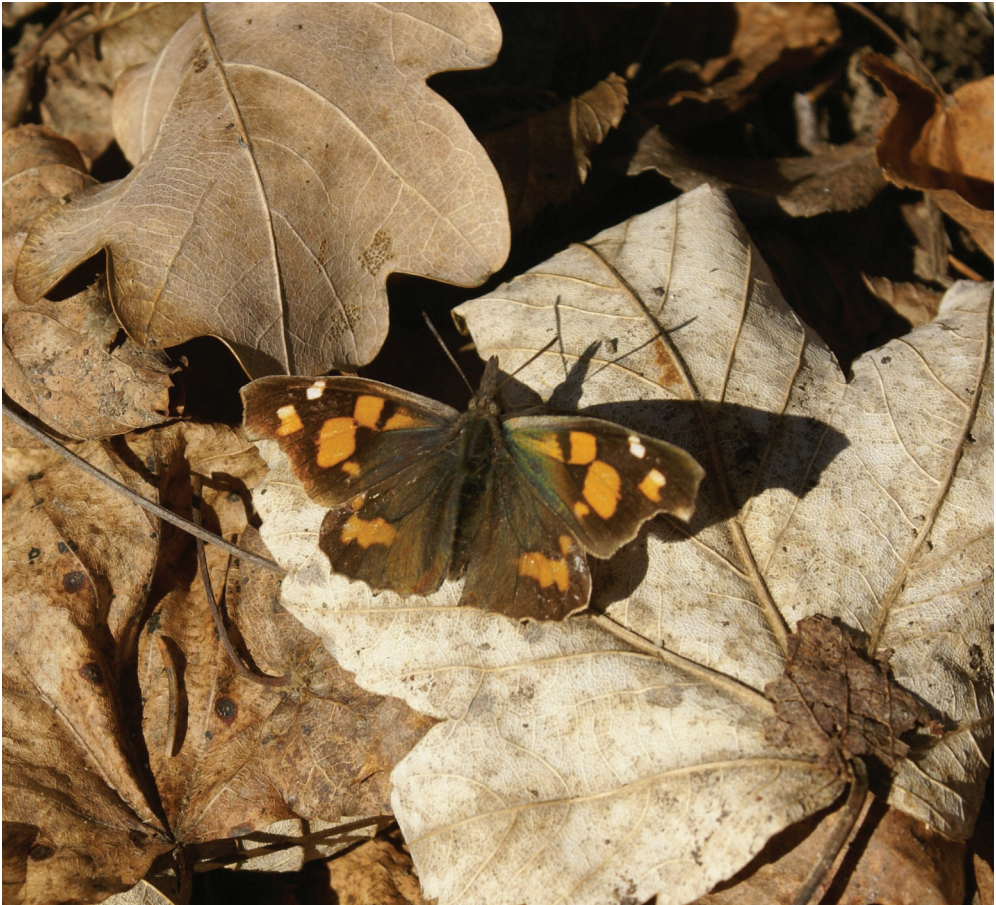
Fig. 4: Libythea celtis found on 25 th of December 2011 near village Polje.

Mediterranean plants present, such as Cotinus coggygria and Fraxinus minor . This extraordinary finding in the middle of winter confirms a mild climate and the presence of temperature inversions on the Šentvid plateau (Mavrič, 2009; Ogrin, 1996). This is also one of the most northern findings of this species in Slovenia.