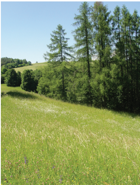
Fig. 3: Locality of Leskov vrh, Šentvid plateau (Locality B) (May, 2011).

One specimen of this local and threatened species was observed on 14 th of August 2011 on extensive dry grassland (Loc. B). Species is most common at middle altitudes,