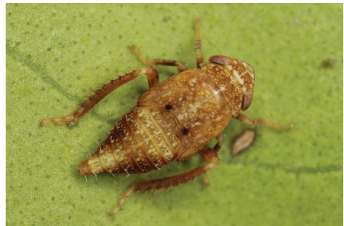
Fig. 9: H. hamatus – 5 th instar nymph