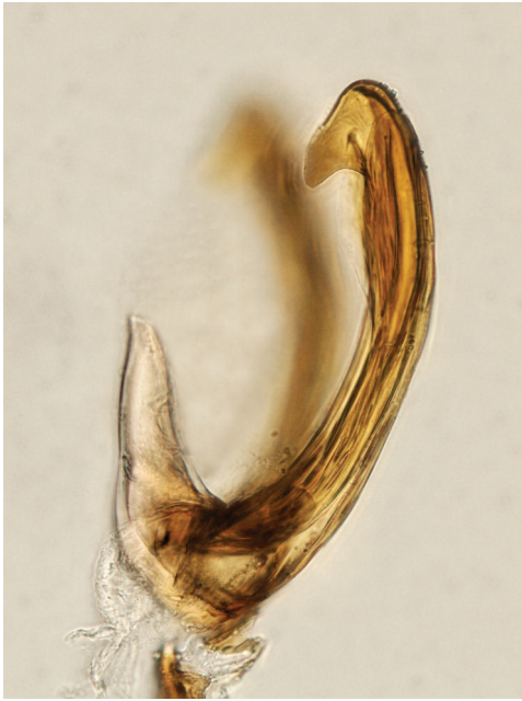
Fig. 7: H. hamatus – aedeagus (lateral view)

slightly lamella-shaped enlarged in distal half and with lateral margins concave below this enlargement. H. callisto is only known from tropical Africa (Republic of Congo) (Zahniser, 2013). H. sellatus is clearly distinguishable by the non-hooked aedeagus shafts, while in H. lindbergi the shafts of aedeagus are hooked, but much slenderer and with outer margins convex. The latter is only known from the Cape Verde Islands.