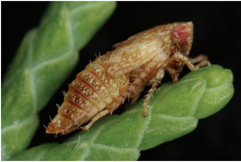
Fig. 10: H. hamatus – 5 th instar nymph feeding on cypress leaves