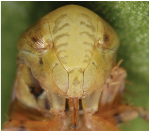
Fig. 5: H. hamatus – head (frontal view)