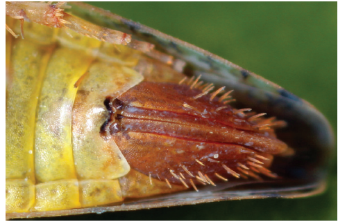
Fig. 4: H. hamatus – female genital segment