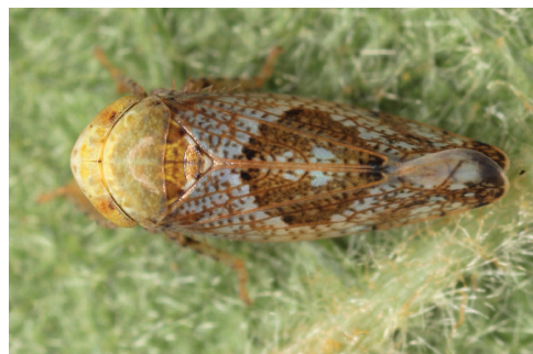
Fig. 2: H. hamatus - dorsal view