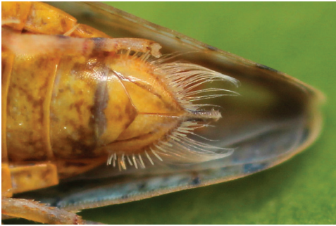
Fig. 3: H. hamatus – male genital segment