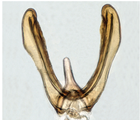
Fig. 6: H. hamatus – aedeagus (dorsal view)

5 th instar nymphs (Figs. 9, 10): Body 3.5 – 3.8 mm, very variable in coloration, light to dark brown, white yellowish marbled and with continuous light median strip; vertex brown, white marbled with two whitish apical markings and three transversal occipital ivory-white strips; metanotum with two submedian dark brown to black suffused spots posteriorly; legs yellowish to dark brown, often distinctly red mottled; body dorsally apparent bare, but covered with sparsely scattered minute hairs; setae on tergites III - VIII in numbers 4/4/4/4/4/6, strong, white and sticking out; posterior margins or posterior half of tergites often reddish, sternites yellowish, mostly red to brownish mottled.