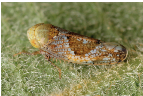
Fig. 1: H. hamatus - lateral view

Female genitalia (Fig. 4): caudal margin of 7 th sternite concave medially with an emarginated black process.