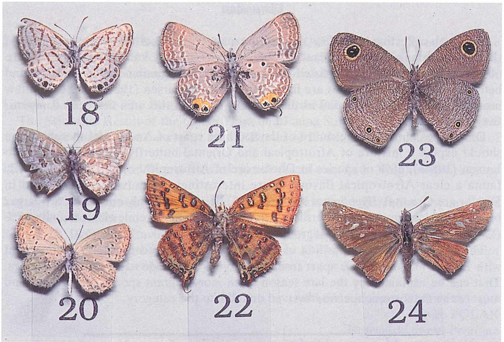
Fig. 2: 18. Tarucus rosaceus Austaut 1885, 19. Cycareus virilis Aurvillius 1924, 20. Zizeeria knysna (Trimen 1862), 21. Euchrysops osiris (Hopffer 1855), 22. Axiocerces harapax kadugli Talbot 1935, 23. Yipithima asterope asterope (Klug 1832), 24. Pelopidas mathias mathias (Fabricius 1798) (underwings)