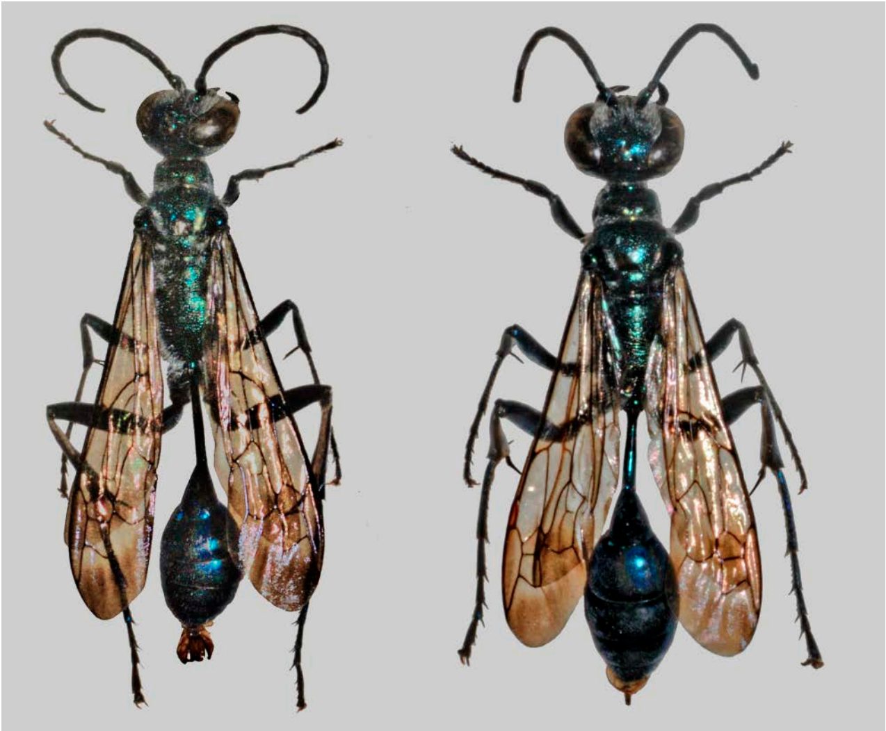
Fig. 1: Chalybion bengalense (Dahlbom), ♂ and ♀ from Legnago (Verona, Italy).