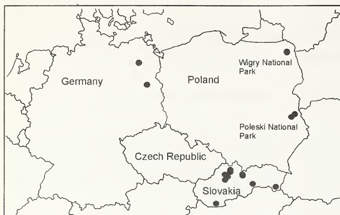
Fig. 1: Distribution of Emblyna brevidens in Poland and in countries adjacent to Poland.

Habitat study using Plant Habitat Indices (ELLENBERG et al. 1992, ZARZYCKI et al. 2002) was conducted on all islands and the mainland. In addition, habitat study was also carried out at the Lake Mamry archipelago (co-ordinates: 54°00'–54°10'N, 21°30'–21°52'E). The data were used to find islands on which E. brevidens seemed likely to exist.