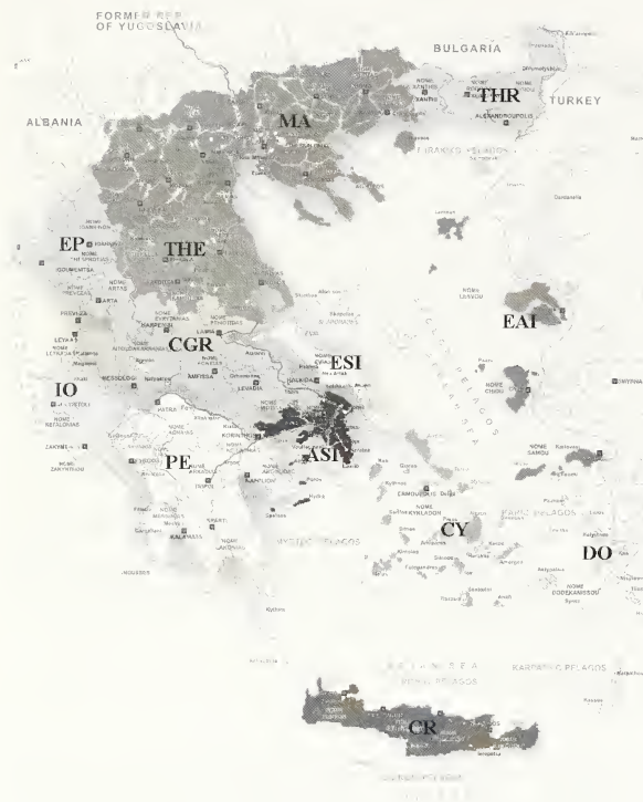
Figure 1: Map of different geographical regions in Greece.

sideae – 1, Uloboridae – 1, Nesticidae – 4, Theridiidae – 4, Anapidae – 1, Linyphiidae – 16, Tetragnathidae – 4, Araneidae – 1, Lycosidae – 1, Agelenidae – 21, Amaurobiidae – 4, Gnaphosidae – 6, Philodromidae – 1, Thomisidae – 2, Salticidae – 2 (Table 1). One species is new for the Greek spider fauna: Porrhomma convexum (Westring, 1861) (marked in the list with *), a spider with a Holarctic distribution and widespread in European caves. It is also well represented in the caves of the Balkan Peninsula – and not only established in the caves of Croatia, Romania and Turkey (DELTSHEV 2008). The number of species is high and represents about 13 % of the Greek spiders. This is also evident from a comparison with the number of cave-dwelling spiders recorded from the other countries of the Balkan Peninsula: Bulgaria – 99, Croatia – 63, Serbia – 59, Bosnia and Herzegovina – 52, Macedonia – 44, Montenegro – 44, Slovenia – 43, Albania – 10, Turkey – 8, and Romania – 4 (DELTSHEV 2008). The established number of species, however, depends not only on the size of the regions, but also on the degree of exploration. The most characteristic are the families: Leptonetidae (8.2 %), Pholcidae (9.2 %), Dysderidae (11 %), Linyphiidae (14.6 %), and Agelenidae (19.2 %). The families with largest number of anophthalmic species are Leptonetidae