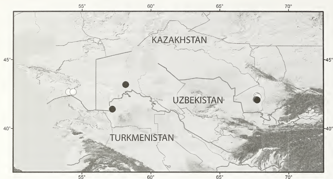
Fig. 6: Collection localities of Oculicosa supermirabilis Zyuzin, 1993. Closed dots – original data), open dots – literature-derived data.

kent, Shymkent] Area, Otrar Distr., Kyzylkum Desert, N foothills of Karaktau [=Kairaktau] Hills, c. 43.8 km NW of Bairkum, nr. Tabakbulak (42°21'26.7"N, 67°41'56.3"E), clayey soil, c. 225 m. a.s.l., 23-25.05.1993, A. A. Zyuzin leg. – (3) Kazakhstan, South Kazakhstan [=Chimkent, Shymkent] Area, Arys' Distr., Kyzylkum Desert, c. 35.2 km NW of Bairkum, Karaktau [=Kairaktau] Hills, Karamola Mt., top part (42°16'48.4"N, 67°45'28.7"E), c. 376 m. a.s.l., 29-31.05.1993, A. A. Zyuzin leg.