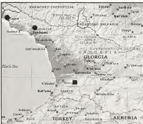
Fig. 14: Records of Robertus golovatchi . Square – original type locality; circles – present records.

Type Locality: Georgia, Chokhatauri Distr., Bakhmaro Pass, ca. 40 km SE of Nabeghlavi, Meskheta Mt. Ridge, 1550–1700 m a.s.l., Abies-Picea-Fagus forest (ESKOV 1987), 41°41'10"N, 42°02'05"E (to determine the geographic coordinates a military map was used).