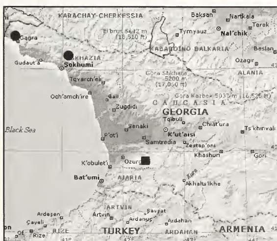
Fig. 14: Records of Robertus golovatchi . Square – original type locality; circles – present records.

Type Locality: Georgia, Chokhatauri Distr., Bakhmaro Pass, ca. 40 km SE of Nabeghlavi, Meskheta Mt. Ridge, 1550–1700 m a.s.l., Abies-Picea-Fagus forest (ESKOV 1987), 41°41'10"N, 42°02'05"E (to determine the geographic coordinates a military map was used).