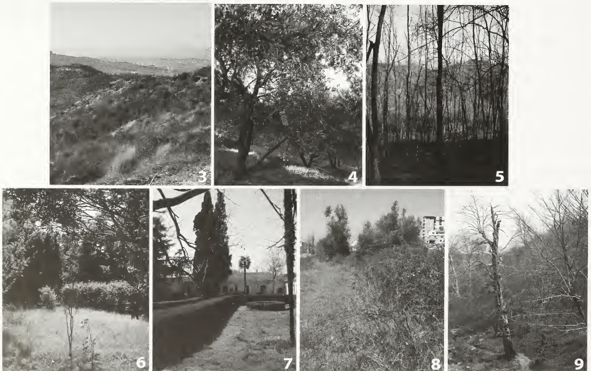
Figs. 3–9: Localities (3: L1, 4: L2, 5: L3, 6: L4, 7: L5, 8: L6, 9: L7) where were placed pit fall traps, listed from West to East of Tirana

In total, 400 specimens of spiders including 310 males and 90 females, representing 78 species from 49 genera and 24 families were collected. Seven spe-