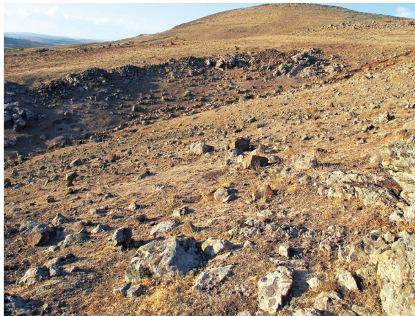
Fig. 2: Envenomation locality in Kilis Province close to the Syrian border