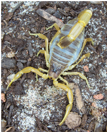
Fig. 1: Leiurus abdullahbayrami , adult female from Kilis Province in Turkey