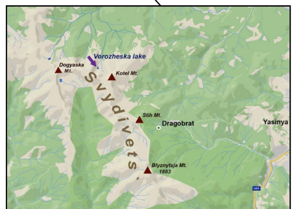
Fig. 1: Locality of Mermessus trilobatus