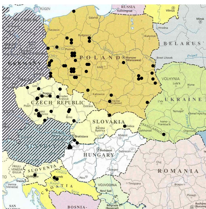
Fig. 3: Map of known records of Mermessus trilobatus in eastern Central and Eastern Europe (see text for references). In the shaded area, the species is widely distributed and found at many localities.