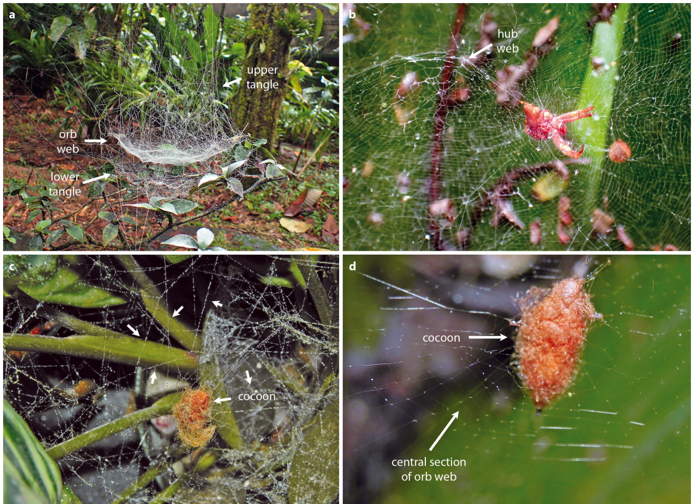
Fig. 1: Distinct aspects of the web of Kapogea cyrtophoroides . a. Natural web in the forest (the web in the picture is similar to at least other 20 webs we have seen in the field). b. The hub of a natural web. c. Cocoon web that the larva induced the spider to build after the spider was removed from its web; arrows point to cocoon web threads. d. Central section of the cocoon web and the wasp's cocoon

to 26.0 °C and the mean annual precipitation from 3500 to 4500 mm at these sites (Martínez 2012, Tirimbina Biological Reserve 2010). Spiders and their hosts were collected in mature and old second growth lowland rainforests.