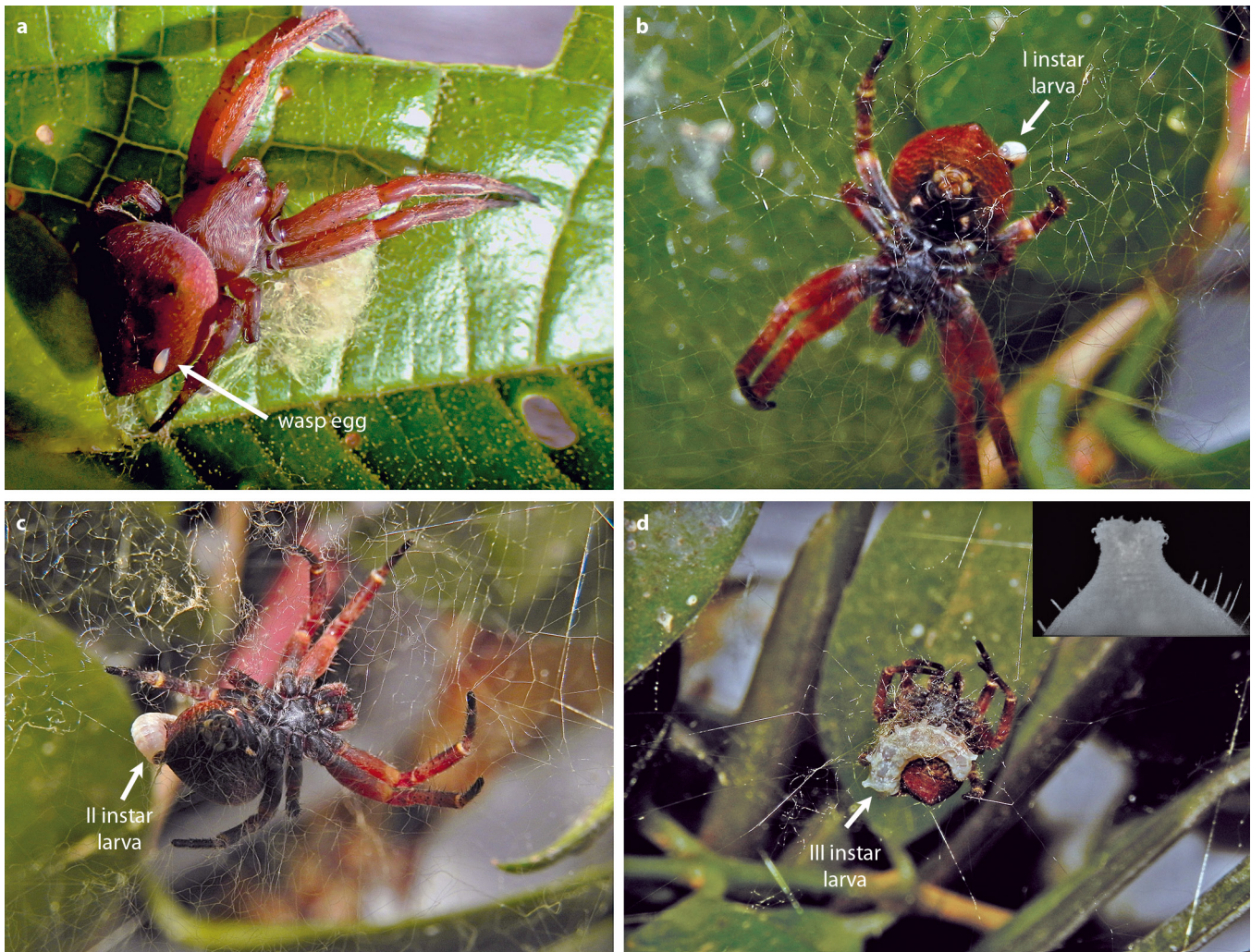
Fig. 2: Egg and different larval stages. a. Egg recently attached to the spider's opisthosoma. b. First instar larva recently emerged from the egg. c. Second instar larva. d. Third instar larva feeding on the recently killed spider; details of the dorsal hooklets are visible in the inset

During the first two stages, the larva only grew in size, with no obvious morphological changes (Fig. 2b). During this period the larva sometimes appeared to feed on the spider's hemolymph: the larva's mouth contacted the spider's cuticle, and peristaltic contractions moved posteriorly in the anterior section of the larva's body.