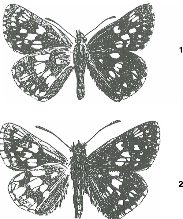
Fig. 1: Syrichtus cribrellum heilong subsp. nov., general view.