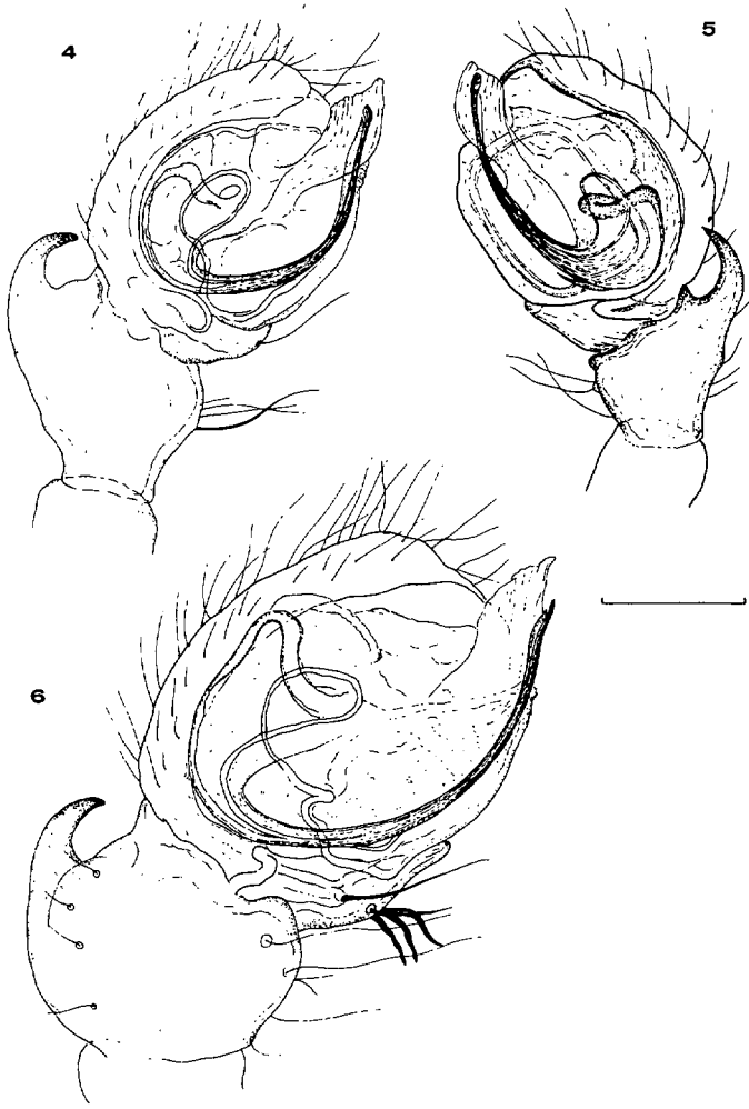
Figs 4 - 6: ♂ palp, internal view. Drepanotylus pirinicus n.sp. (4), D. borealis HOLM (5), D. uncatus (THORELL) (6). — Scale line: 0.20 mm.

species the embolic part is similar, but there are differences in the tip of the embolus. Concerning the female, the most characteristic is D. borealis with its parallel ducts (fig. 10), whereas the curved ducts of D. pirinicus n.sp. (figs 8, 9) resemble those of D. uncatus (see WIEHLE, 1956).