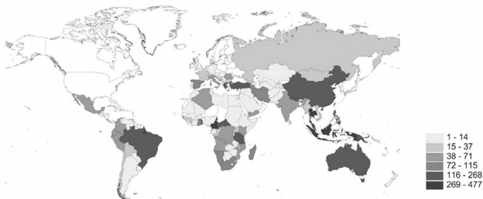
Fig. 1: Distribution of Orthoptera type specimens (including Para- and Lectotypes) housed in German Museum collections. Note the high number of types from Africa, South East Asia and Australia, collected in the last centuries. [From Riede 2003].

Taxonomic literature is scattered over numerous journals and books which are often not easily available because most of the classical references but also many of the new publications are held only in a few libraries worldwide. A recent bibliography on Orthoptera lists over 14,000 titles with taxonomic significance (INGRISCH & WILLEMSE 2004). Moreover the knowledge of the diversity of insects has greatly multiplied since the introduction of the binominal nomenclature nearly 250 years ago. For the Orthoptera alone, the number of known species raised from only 59 taxa in LINNÉ'S (1758) genus Gryllus to almost 30,000 species group names that are currently listed in the Orthoptera Species File (osf2x.orthoptera.org). Together with the increase of knowledge, the definitions of the species concept has changed repeatedly and taxonomic methods have shown great progress. It is thus understandable that historical descriptions are usually insufficient to identify specimens at hand. Fortunately, descriptions of biological species are based on type specimens. In former times, travelling to several museums or loan of specimens were necessary to compare specimens for identification of new material. With the rise of the world-wide web, it is now possible to provide museum information on-line, thereby facilitating access to type material, pictures or any other information related with type specimens (RIEDE 2003).