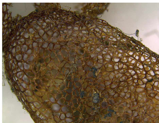
Fig. 2: Lattice structure of P. amerinae cocoon, BERTINGEN, 2011. Length of cocoon approximately 30 mm.

It would obviously be worthwhile if further data could be obtained which might clarify the present status of P. amerinae in Germany.