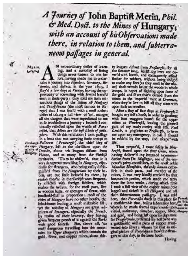
Fig. 1: Travel book of John Baptist MERIN (1615)

Travel books are a special kind of historical sources. In recent years, they are subject to relatively high interest not only historians, but also literary scholars, geographers and other experts. Travelogues literature which contains information about the history of mining in central Slovakia in the 17 th Century can be divided into three groups.