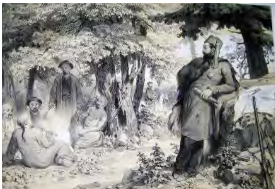
Fig. 3: Altai mountain landscapes made by artist E. E. MEIER