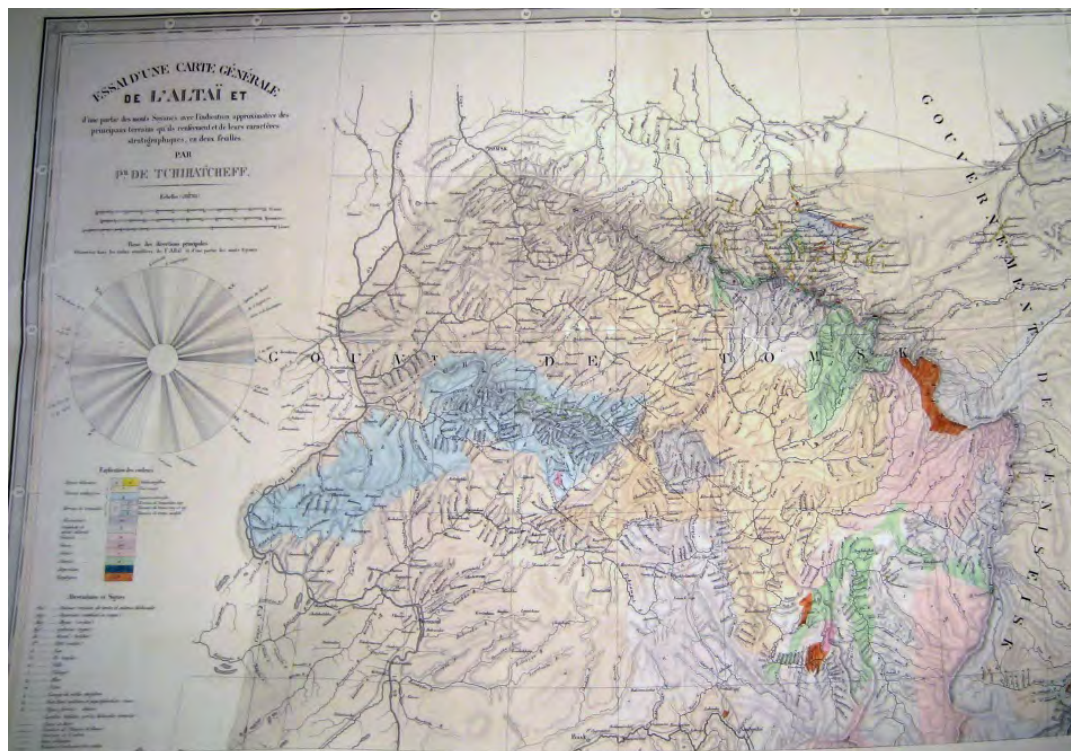
Fig. 1: Petr CHIKHACHEV: map of the Kuznetsk Coal Basin, Altai Mts.

The geological map compiled by P.A. CHIKHACHEV during hundred years remained the only map that provided insight into the geological structure of the Altai region.