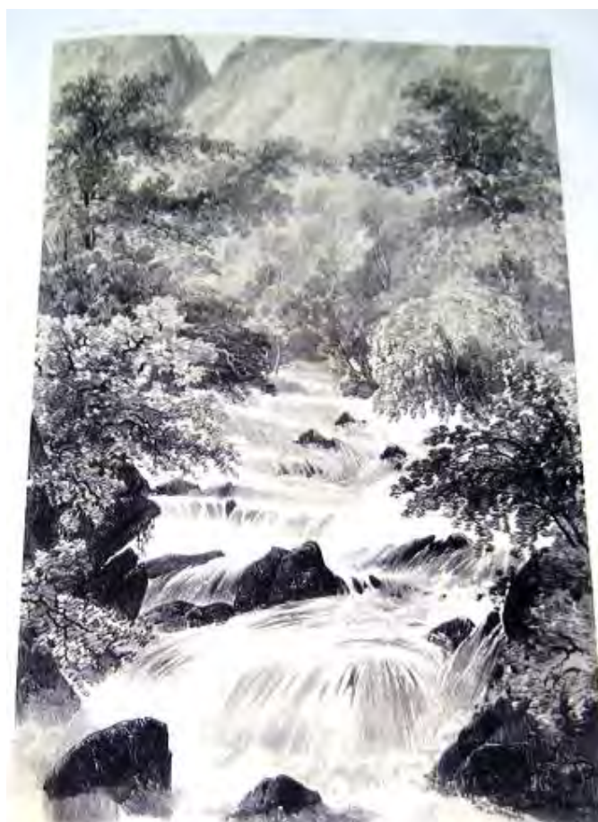
Fig. 4: Altai mountain landscapes made by artist I.K. AIVAZOVSKY