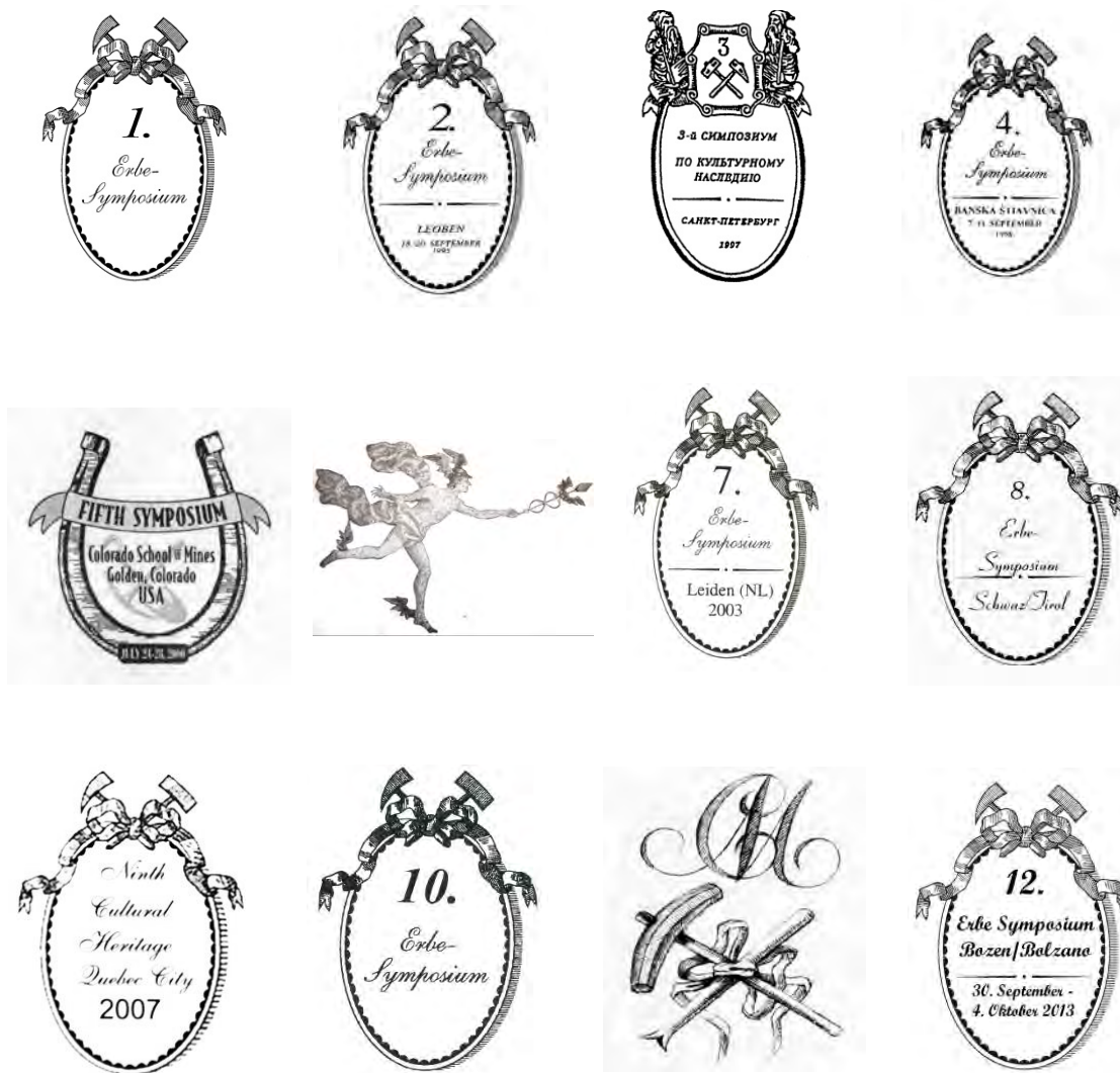
Fig. 2: The „Erbe“-logos - Freiberg 1993 to Bolzano/Bozen 2013. Variations generated from the Bookplate of the Austrian Imperial Chamber of Finance and Mines dominate.