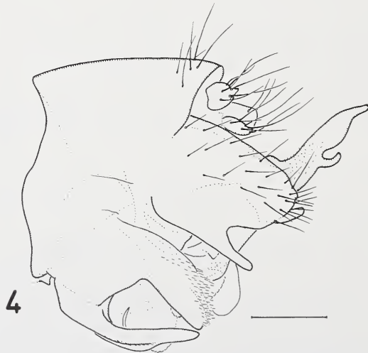
Figs 3—4: Plethysmochaeta males, left faces of hypopygia. 3, P. trinervis , 4, P. tripartita . (Scale bars = 0.1 mm).