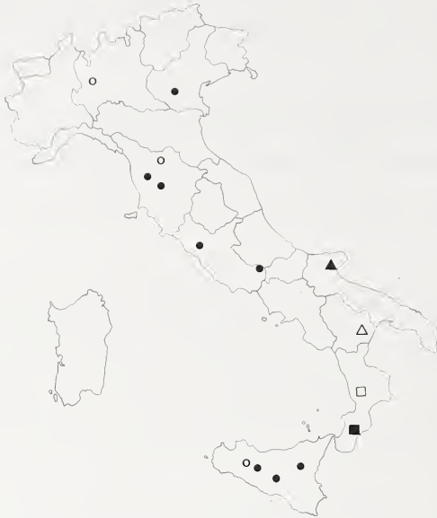
Fig. 1: Collecting sites of specimens reported in the present paper (open symbols) and in literature (filled symbols) (Krapp & Winking 1976; Niethammer 1981; Galleni et al. 1992). Square: Microtus brachycercus ; circle: Microtus savii (X metacentric); triangle Microtus savii (X acrocentric).

Chromosomes were prepared from fibroblast cultures of short terminal tail biopsies (Stanyon & Galleni 1991) and C-, G-banded following previously reported techniques (Galleni et al. 1992).