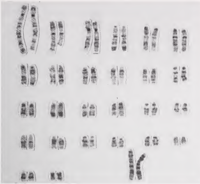
Fig. 2: G-banded karyotype of a female M. savii from Metaponto (PZ).