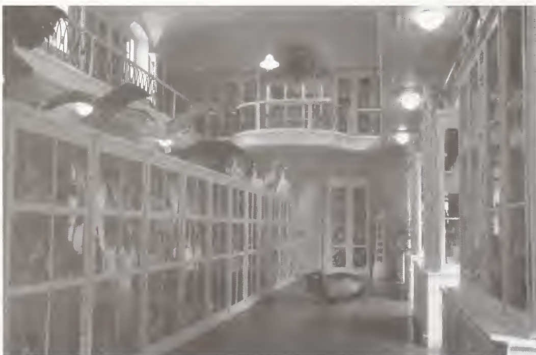
Fig. 2: Main exhibition hall of the Naturkunde-Museum Bamberg.

Altogether, Bamberg's museum holds 1,550 mounted birds of about 800 species, 75 study skins of local species, 19 complete and 12 partial skeletons, 552 eggs and 112 nests. The mounted birds are still the key specimens of the old exhibition hall (fig. 2),