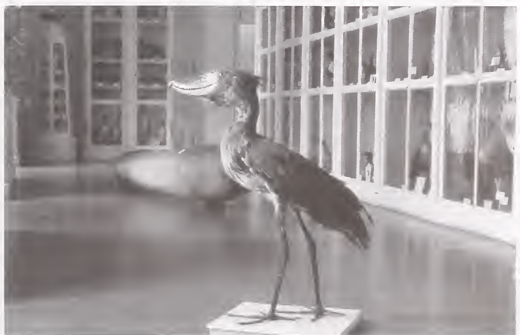
Fig. 4: The two specimens of Shoebills Balaeniceps rex at the Naturkunde-Museum Bamberg, collected by Matthäus KIRCHNER before 1857.

I use the Bamberg collection as a case-study to prove that even bird specimens without easily accessible data may have a validity for science, if time and staff power allow a thorough data check. There are many small collections existing which have suffered huge neglect and data loss. But, as the Bamberg study shows, there might be a chance to restore data to such collections making them important for science in their own right. Therefore I urge researchers to appreciate local collections, regardless of their condition. Although money and staff is often lacking to maintain these collections well, they should at least be kept. In the future some of them might be revealed to be of huge importance for ornithology. Hopefully the Bamberg case study might also encourage those who are responsible for neglected collections to work towards a full documentation of the material or, at least, to stop further data loss and decay.