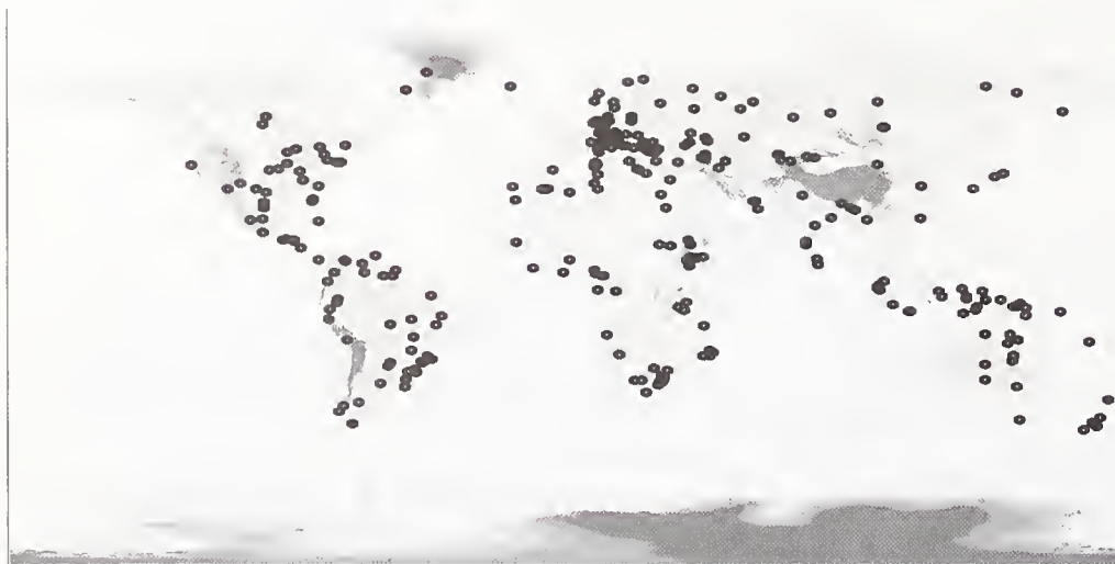
Fig. 6: Result of query 4: map of all located collecting sites referring to the collection Th. ANGELE. Collecting sites which do not exactly match geographical point information are included but not yet specifically made visible on this map by different symbols (ZOBODAT, Linz, Austria).

A change in thinking arose with the common availability of the world wide web's communication possibilities. Now it became apparently necessary to eval-