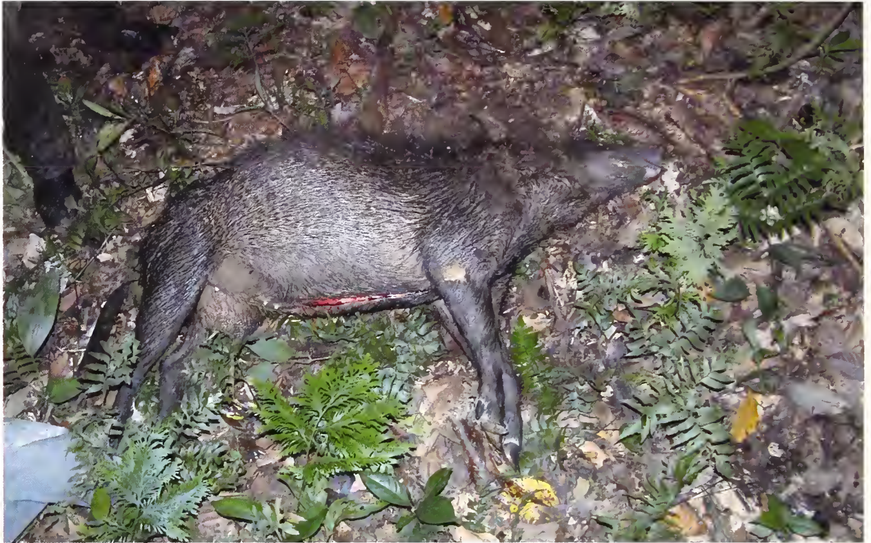
Fig. 1. Young female Pecari maximus , shot at Bioceanica, Bolivia.