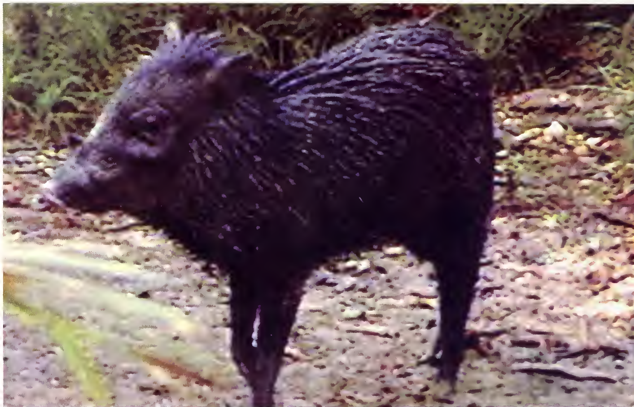
Fig. 4. Live Pecari maximus from the type locality.

trees Bertholletia excelsa . The upper canopy closes at the height of 30–40 m. The densest understory is associated with moist depressions along forest brooks.