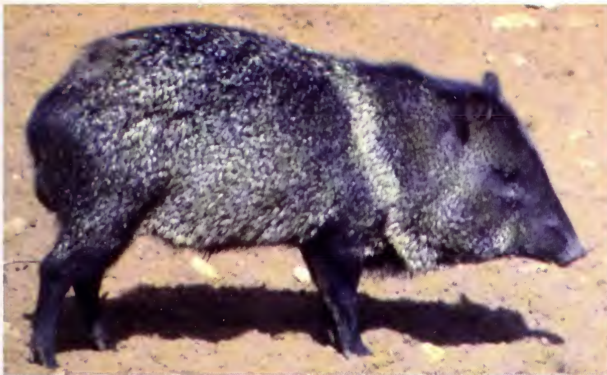
Fig. 5. Live Pecari tayacu , congener of P. maximus to show the different body proportions.