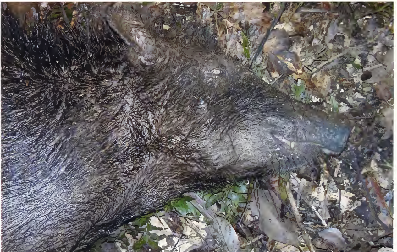
Fig. 2. Lateral view of the head of the same specimen.