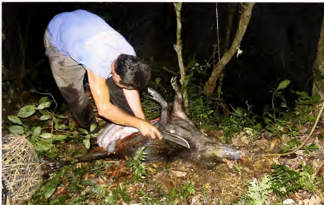
Fig. 3. Local hunter beginning to skin same specimen.

of the cheek area only). The brown dark mottled fur colouration differed from the strongly speckled dark blackish-grey fur colouration of P. tayacu as well as from the blackish brown longer fur of T. pecari . In the figures the differences in fur colour and bristle-haired texture are evident although the freshly killed female pig lay in a forest creek and was therefore wet.