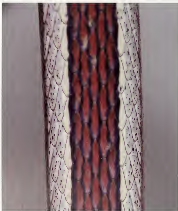
Fig. 22. Psammophis elegans from Pendjari NP, dorsal pattern.

Meizodon coronatus – Trape & Mané (2006 b): on grid map but without specific locality.