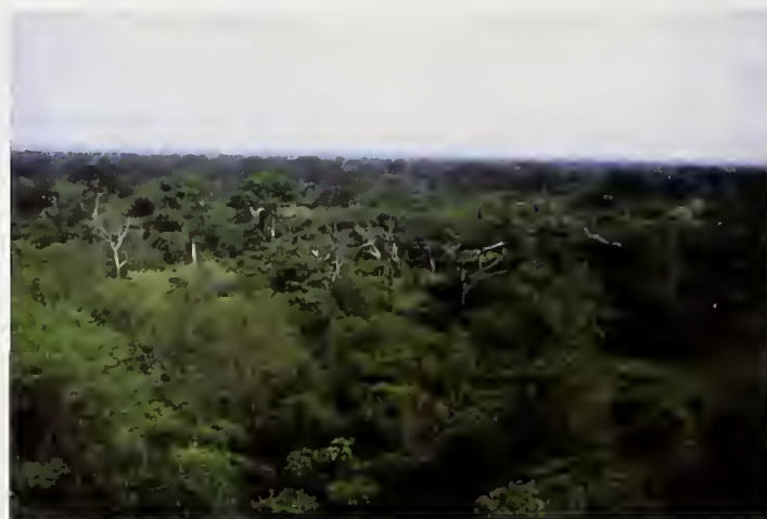
Fig. 1. View on Forêt de Lama, South Benin.

Lama Forest or Forêt de Lama is situated within a depression bearing the same name, 80 km north of Benin's capital Cotonou (Figure 1). It is bordered in the north by the plateau of Abomey and in the south by the plateau of Alada. Lama Forest comprises a total area of 16.250 ha of "forêt classée", 9.750 ha of which belong to the Département Atlantique (Sous-préfecture Toffo) and 6.500 ha belonging to the Département Zou (Sous-préfecture Zogbodomé) (Emrich et al. 1999). The center of this protected area – the protectional status exists since 1947 – is formed by the Noyeau Central (4.777 ha) which is composed of primary forest (1.937 ha), degraded forest (1.388 ha) and of teak plantations and fallow grounds (together 1.452 ha) (Figure 2). The Noyeau Central is surrounded by ca 9.000 ha of forestry plantations. In earlier times, the primary forest covered the whole Lama depression which stretches over the south Benin in a west-east direction. Un-