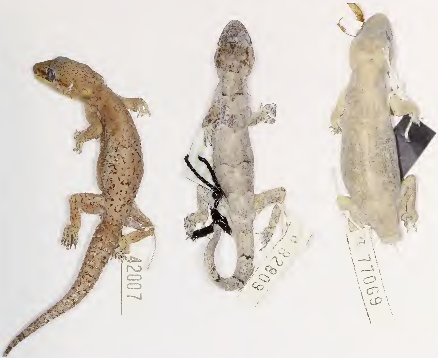
Fig. 12. Hemidactylus angulatus (s.str.) from Godomey near Cotonou (left), H. mabouia from Cotonou (center) and H. aff. mabouia, also from Cotonou (right).