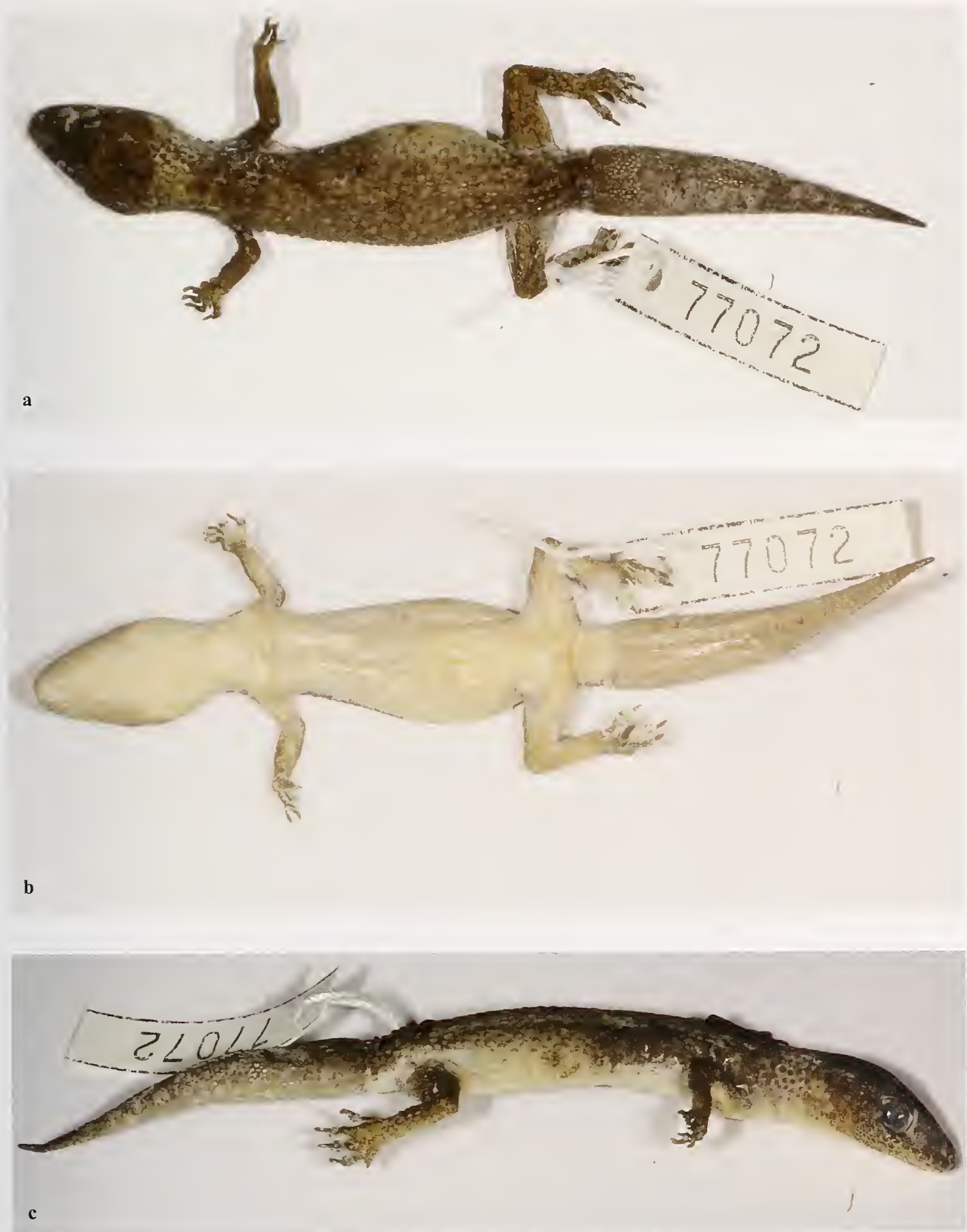
Fig. 13. Hemidactylus lamaensis n. sp., holotype from Lama Forest (Noyeau central) in dorsal (a), ventral (b) and lateral (c) view.