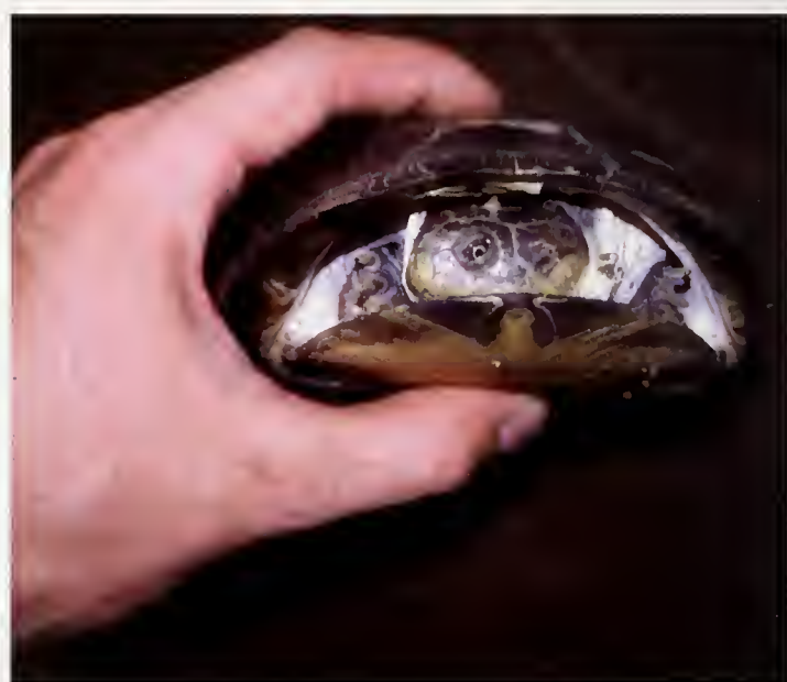
Fig. 8. Pelusios castaneus from near Bohicon, southern Benin.

Remarks. This common and widespread species was observed in all habitats including human settlements where vertical structures such as tree trunks and/or house walls were preferred. It was, however, never seen in the closed forest.