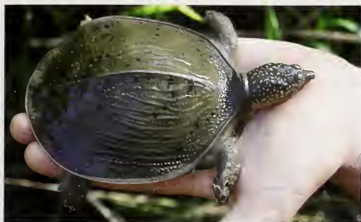
Fig. 18. Cyclanorbis senegalensis , juvenile from Pendjari NP, northern Benin.