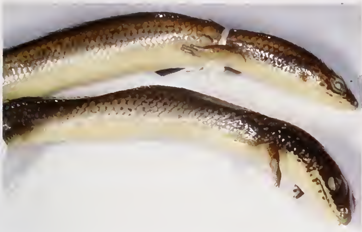
Fig. 14. Mochlus guineensis , from Cotonou (above) and Lama Forest (Noyeau central) (below).

invariably to escape upwards. They were mainly active between 11.00h and 15.00h, at air temperatures of 31–32°C.