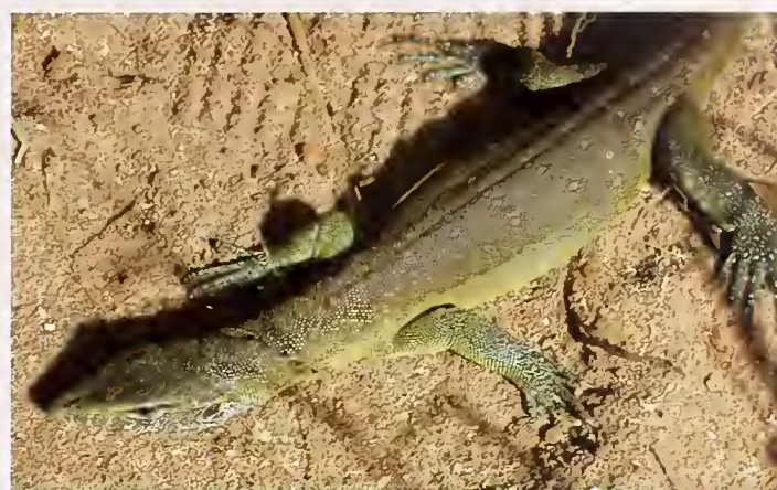
Fig. 21. Varanus niloticus , subadult, unusually light-coloured specimen from Pendjari NP.

Gongylophis muelleri – Trape & Mané (2006 b): on grid map but without specific locality.