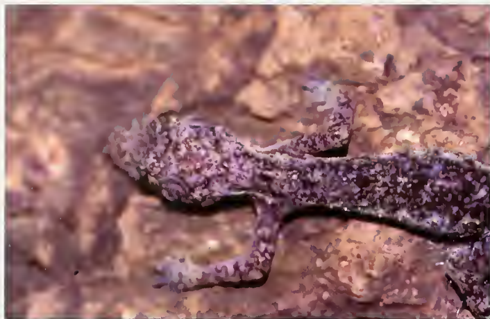
Fig. 9. Hemidactylus ansorgei from Lama Forest (Noyeau central), first country record.

Material examined. ZFMK 42006-009, Godomey near Cotonou, coll. by W. Schröder, August/September 1984; ZFMK 77070, Bohicon, coll. by K. Ullenbruch, 17 April 2002; ZFMK 82813-814, Cotonou, coll. by Thibault Lachet, 22/23 April 2004.