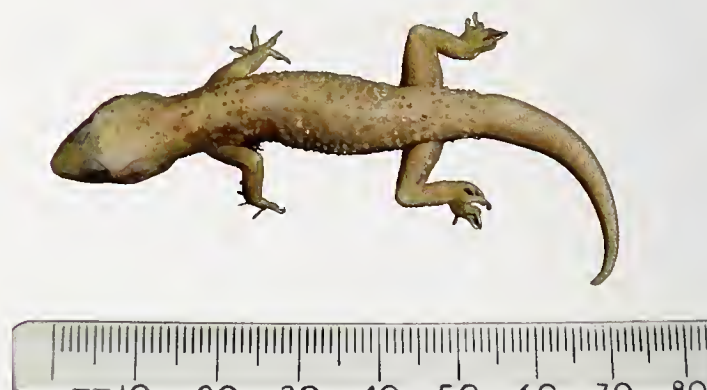
Fig. 11. Hemidactylus angulatus / guineensis complex: lectotype of Hemidactylus stellatus Boulenger, 1885.

Steindachner (1870) described H. affinis from Gorée and Dagana, Senegal, and diagnosed it also only against H. verruculatus (= H. turcicus ). He stressed the similarity of these two species, particularly concerning the size of their strongly keeled tubercles. The type series of H. affinis closely resembles the savannah-dwelling H. guineensis . In his description of H. stellatus , Boulenger (1885) compared it with H. brookii and H. gleadowii and stressed the presence of pure-white tubercles intermixed with a majority of dark brown ones which inspired him to the name stellatus (= starred). These white tubercles are indeed more obvious in the savannah-dwelling form (Figure 11) and