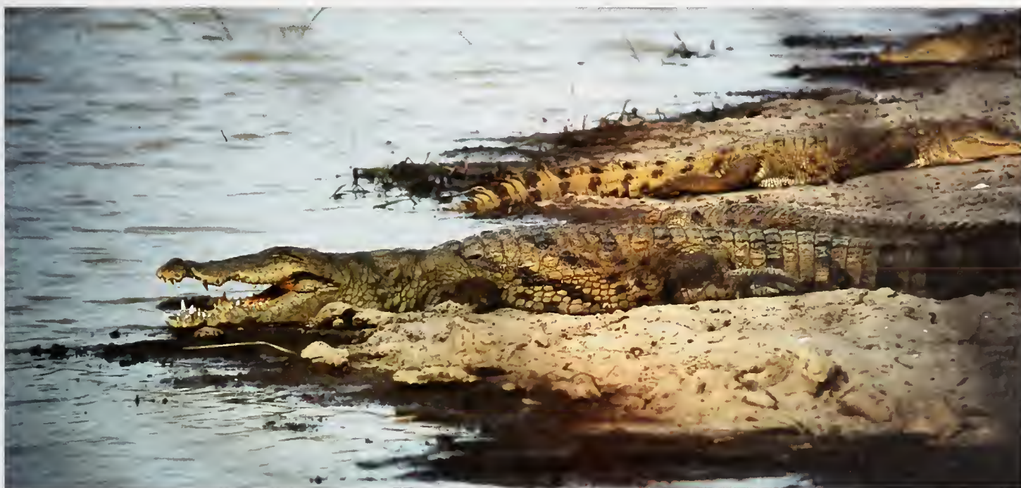
Fig. 19. Crocodylus suchus , Pendjari NP.

Tarentola ephippiata – Bauer et al. (2006): Pendjari NP.