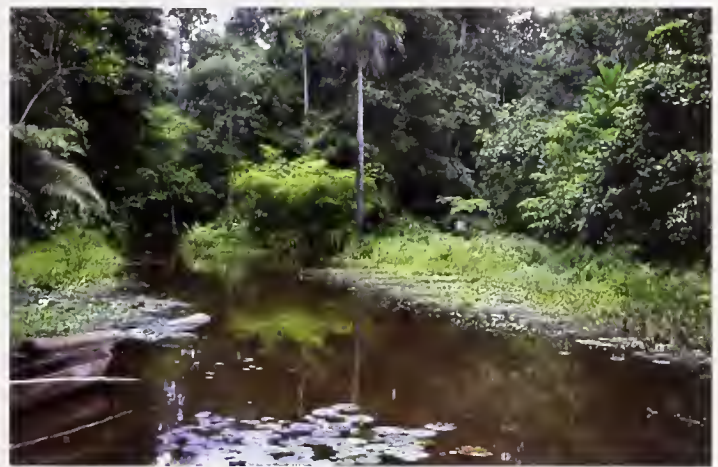
Fig. 5. Flooded forest of Forêt de Lokoli.

Finally, some reptiles were collected also in Cotonou and Bohicon, on house walls and in gardens, and markets were visited to inspect the reptile species offered. Most of the reptiles were collected by UK by visual encounter and focal sampling. Moreover, specimens were brought by the locals, particularly by two snake hunters from Didja and Za-Kpota respectively who even received an alcohol-filled bucket in order to keep interesting snake finds for some days. The Swiss zoologists of the Biolama project provided us with few, but very important voucher specimens (e.g. Hemidactylus sp.n., Holaspis guentheri ) taken in trunk electortraps used for the entomological survey.