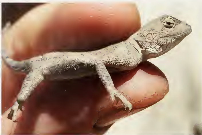
Fig. 20. Agama gracilimembris , Pendjari NP, first rediscovery in Benin after its first description from this country nine decades ago.