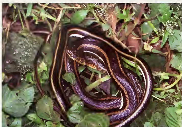
Fig. 16. Psammophis sudanensis from Bohicon, southern Benin.