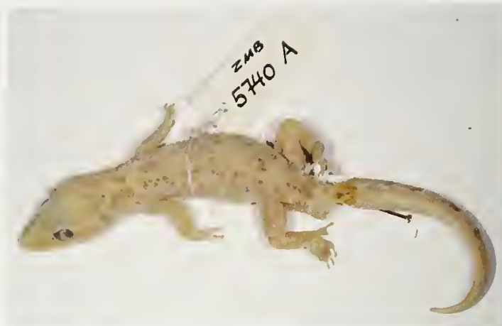
Fig. 10. Hemidactylus angulatus / guineensis complex: lectotype of Hemidactylus guineensis Peters, 1868.

Examination of the lectotype (Figure 10) of H. guineensis Peters, 1868 [described from "Ada Foah, Guinea" (= Adafoa, Ghana; not Adafer, Mauritania, as suggested by Loveridge 1947 and Wermuth 1965!) and compared by Peters (1868) only with H. verruculatus (= H. turcicus )] revealed that despite its provenance from coastal West Africa, it resembles the savannah form rather than the forest form which would strengthen a partial sympatry with the forest-dwelling H. angulatus . However, the distinguishing key character between both forms, i.e. the number of granules bordering the nostril above rostral and first supralabial (Thys van den Audenaerde 1967), has been disproved already by Böhme (1978), and other scalation differences also seem to be insufficient for a clear separation of both forms. Habitus differences could possibly be found in colour pattern, which often seems to consist of