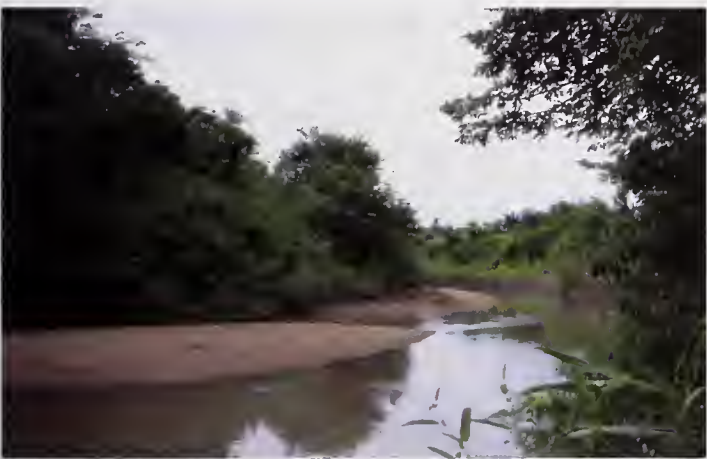
Fig. 4. Gallery forests at the Zou River, southern Benin.