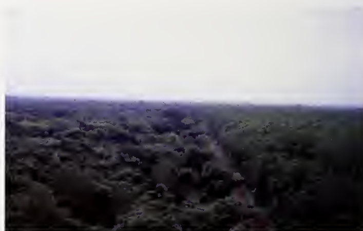
Fig. 2. Primary forest of Forêt de Lama (Noyeau central) (left) with bordering teak plantations (right)

til 1946, large areas of natural forest were already destroyed, and only 11.000 ha remained. Since the 1960ies reforestations are taking place which favoured, however, mainly teak plantations. The natural vegetation has been protected only from 1988 onwards (Emrich et al. 1999). Mean annual precipitation is 1100 mm with two peaks (big and small rainy seasons) in March to June and September to October respectively. The annual mean temperature lies between 25–29°C. The eastern part of the Lama depression is crossed – in north-south direction – by the Ouémé River valley. Close to Lama Forest, there are only few smaller creeks. During the rainy seasons, however, large parts of the area are changed into overflowed marshlands. Due to these repeated inundations and stagnant waters, there are only six dominant tree species in Lama Forest, viz. Dialium guineense , Diospyros mespiliformis , Albizia zygia , Azelia africana , Khaja senegalensis , and Anogeissus leiocarpus . The Noyeau Central consists mainly of a mixture of relicts of a semideciduous forest which floristically approaches the "Forêt de Samba"