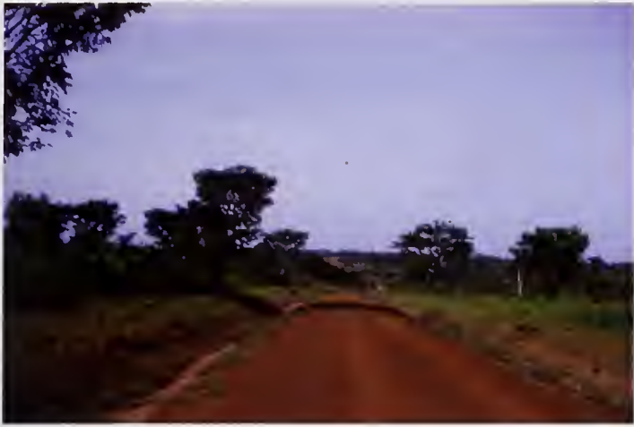
Fig. 3. Landscape round the village of Didja, southern Benin.

type (Mondjokannagni 1969) and of secondary forest in various developmental stages. Within this dynamic system, the South American fast-growing asteracean neophyte Chromolaena odorata is commonly found along small roads and paths and at the forest edges. In smaller plantations, next to the larger ones with teak, trees such as Gmelina arborea , fraké ( Terminalia superba ), samba wood ( Triplochiton skleroxylon ) and, especially in the Toffo sector, the fire-resistant Cassia siamea are cultivated (Specht 2002).