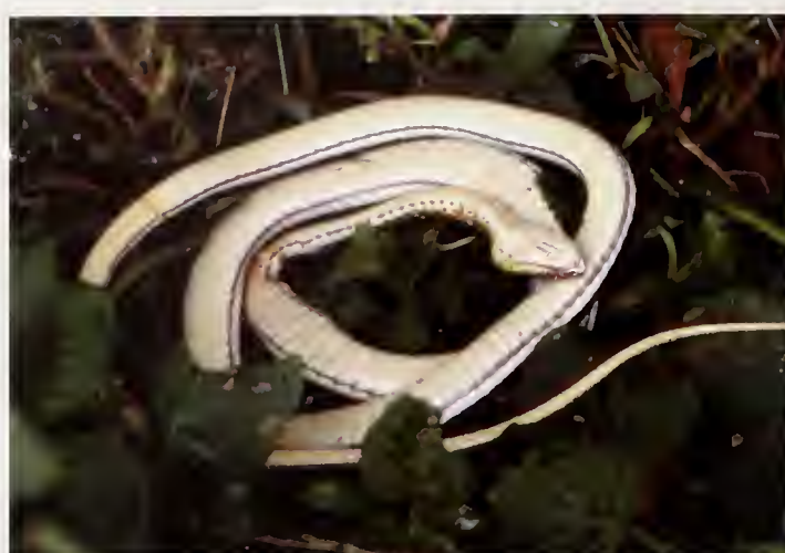
Fig. 17. The same specimen from below.

so earlier records of P. sibilans from West Africa (e.g. Chabanaud 1916) refer to this form which, in our opinion, is not conspecific with the true P. sibilans from Egypt. Many not yet fully grown but nonetheless adult (mature) specimens may retain more or less distinct reddish dorsolateral stripes along the body. The belly is light whitish to yellowish and patternless (no dark hairlines along the ventral plates), but supralabials, sublabials and gulars show some dark pigmented spots (see Böhme et al. 1996). The anal shield is entire. Its taxonomic status and nomenclatural status needs still to be assessed.