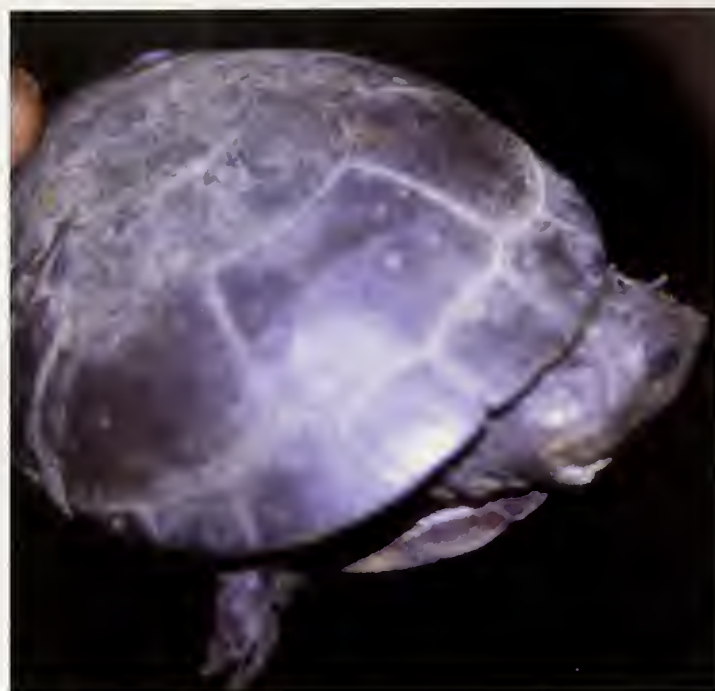
Fig. 7. Pelomedusa subrufa from near Bohicon, southern Benin.

gust/September 1984; ZFMK 77061-062, Bohicon, ZFMK 77063-064, Cotonou, all coll. by K. Ullenbruch, May/June 2002.