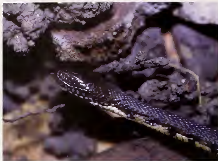
Fig. 15. Afronatrix anoscopus , juvenile, from Lokoli Forest, first country record.

Material examined. ZFMK 77014, Za-Kpota, coll. by native hunter, May 2002.