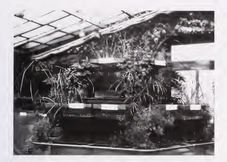
Fig. 5. Tropical jungle landscape made of aquaria and plants (1912).