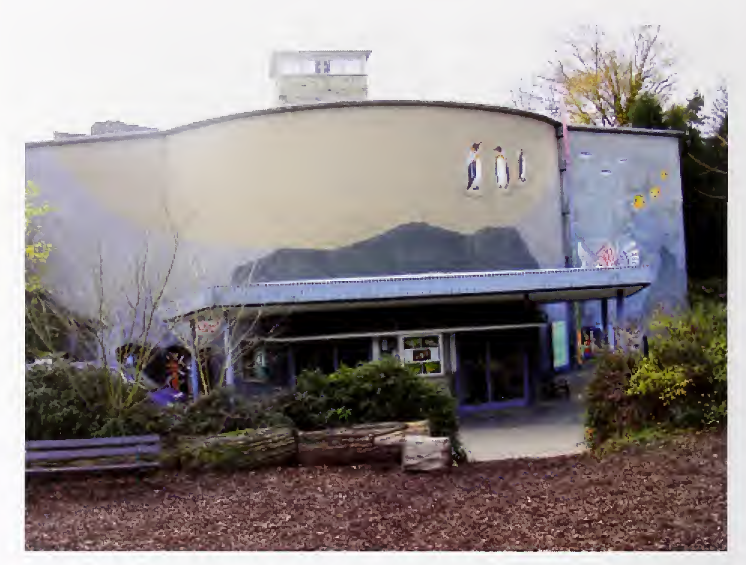
Fig. 11. The entrance to the Frankfurt Exotarium still preserves the charm and character of the 1950s when it was rebuilt (2008).

- even rare animals such as a few Psammobates from two different species. Some of the shipments seized contain quite a number of specimens, for example 300 Geochelone elegans or more than 70 Cordylns mossambicus and C. rhodesianns and, repeatedly, also large numbers of poison arrow frogs. Particularly with regard to the more common species and relatively high numbers of specimens, it is extremely difficult to find appropriate people and institutions willing and able to take them on. All these animals are lost to the natural world as they cannot usually be taken back and released into the wild.