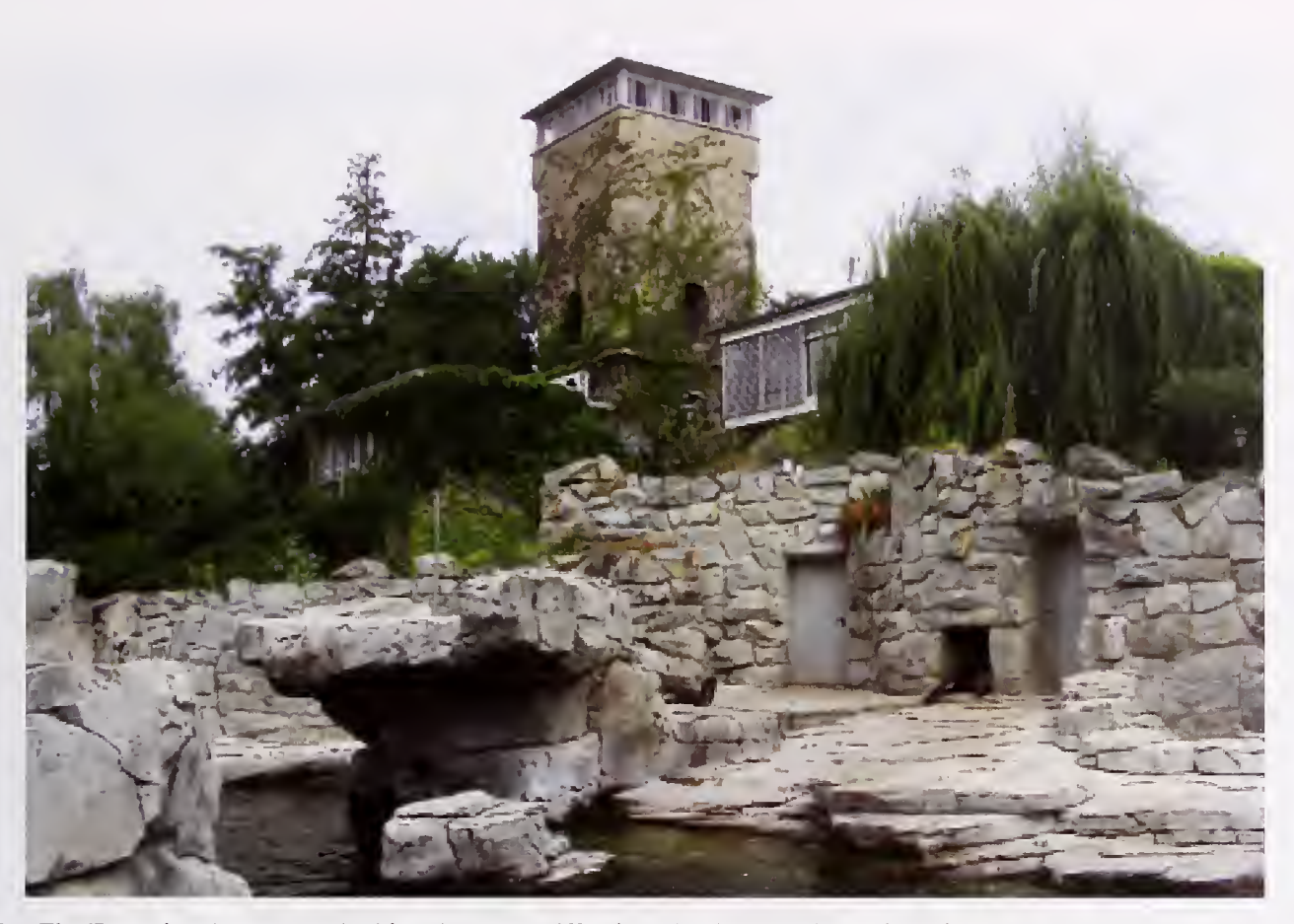
Fig. 10. The Exotarium Tower overlooking the "seal cliffs" (2008).

sor, constantly tried to improve the living conditions of the animals, trying out all sorts of lamps, heating equipment and other means to improve the climate control of the terraria. They also did lots of work on nutrition and disease prevention and carried out the associated physical changes and improvements to the building, such as special rooms to prepare food, raise foraging animals and raise newly born reptiles and amphibians. Terraria were equipped with appropriate soil substrate for digging species as well as stones and trees for climbing species, in addition to hiding places and other structures, paving the way to modern reptile keeping. Another remarkable change was the renovation of the crocodile enclosure which had made it necessary to give up the crocodile collection in around 1975 and to send the gharial (which had been living at Frankfurt Zoo since 1958) to the Gharial Breeding Centre in Orissa, India in 1979. After the renovation of the building had been completed, Nile crocodiles returned to the zoo in 1977, but the enclosure turned out to be unsuitable for that aggressive species.