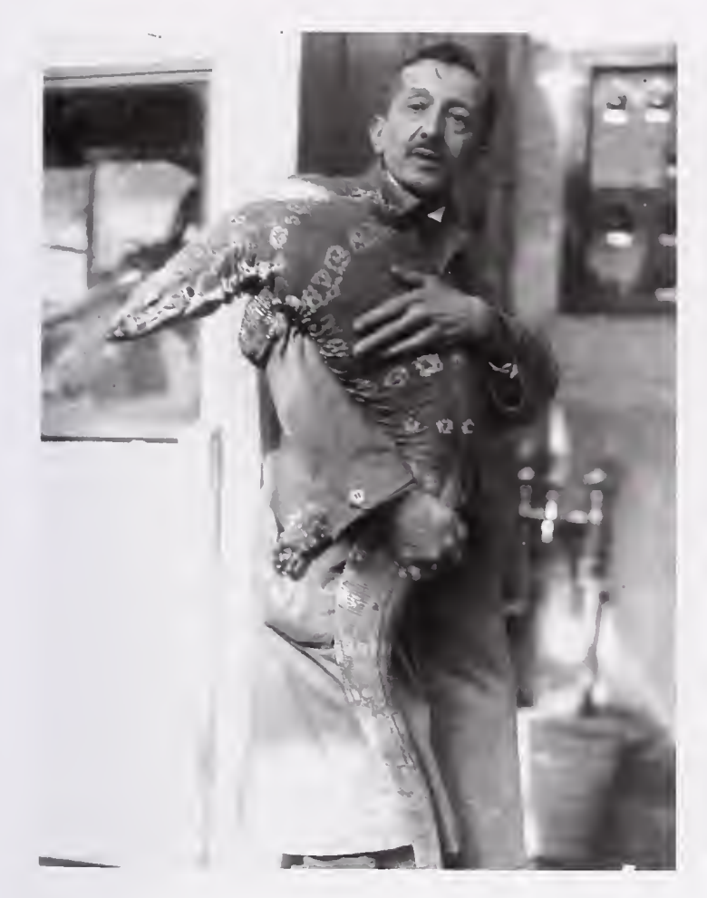
Fig. 7. Varauns salvator "Bubehen" and his keeper – in the truest sense of the word! – in 1929.

In that year, the zoo was home to an Alligator mississippiensis , a Trionyx triunguis and two Heloderma suspectum that had been living at the zoo since 1905, 1912 and 1927 respectively, as well as a Chinese alligator. The latter had moved to Frankfurt in 1910 when the Berlin Aquarium had to be closed because of financial problems and Frankfurt took over its entire reptile collection. This alligator had come to the Berlin Aquarium in 1886 and so had lived for 30 years in Frankfurt when he died in 1940.