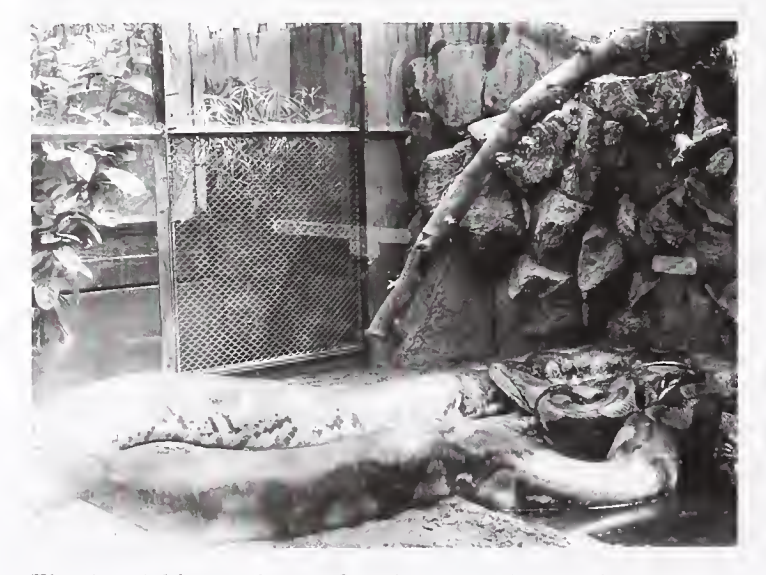
Fig. 4. A big specimen of Python reticulatus in its terrarium (1912).

It is plain that mortality was high. The 1895 zoo guide (the first to be published after ten years!) lists, however, an impressive number of species – or to be more precise: two crocodiles, eleven turtles, 17 snakes, 22 lizards and ten