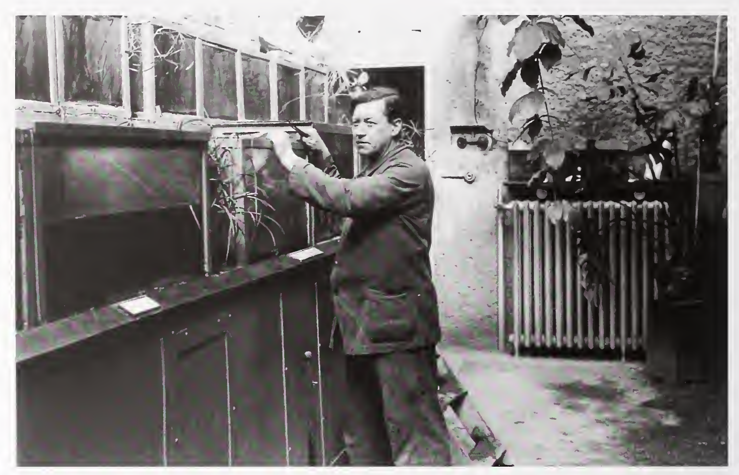
Fig. 8. An unidentified keeper working in the terrarium section (1936).