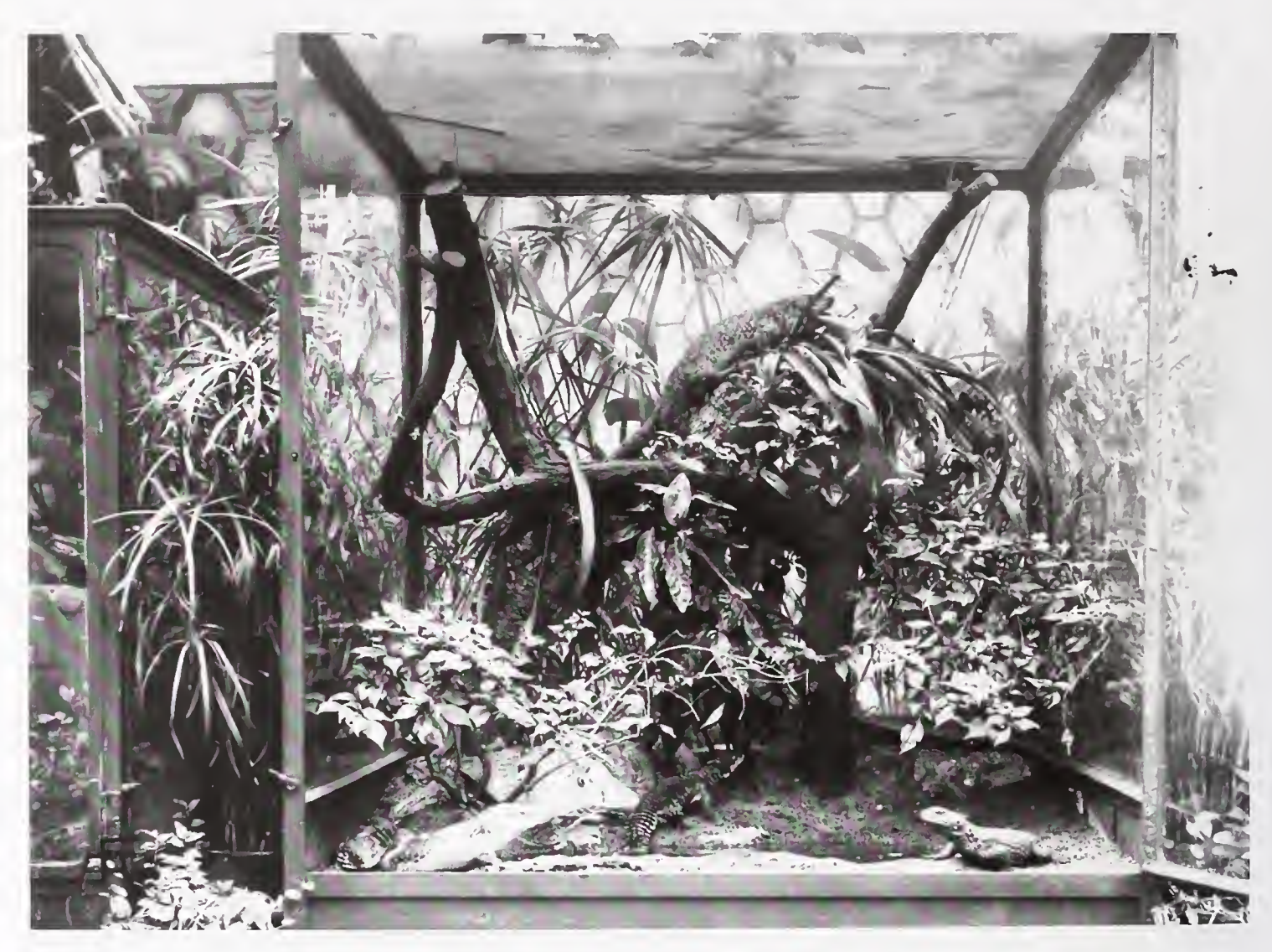
Fig. 3. Mixed life in a tropical jungle environment: Tiliqua rugosa (?), Cordylus giganteus and Macroscincus coctei (1912).

It is plain that mortality was high. The 1895 zoo guide (the first to be published after ten years!) lists, however, an impressive number of species – or to be more precise: two crocodiles, eleven turtles, 17 snakes, 22 lizards and ten