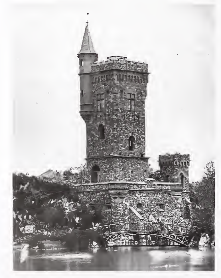
Fig. 1. The "romantic" Aquarium tower of Frankfurt Zoo above the lake in 1880.

the City of Frankfurt. Reptiles and fishes had turned out to be a real attraction for the visitors, and so, from the beginning, the plan for the new zoo included designs for a herpetological exhibition and aquaria. Due to a number of complications and especially as a consequence of the