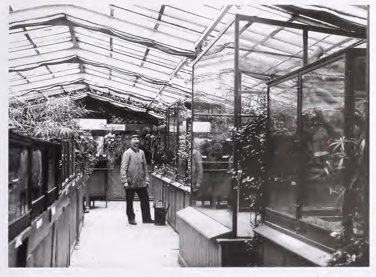
Fig. 2. In the newly opened "Reptile Hall" sunlight was seen an important factor for the well being of reptiles (1904).