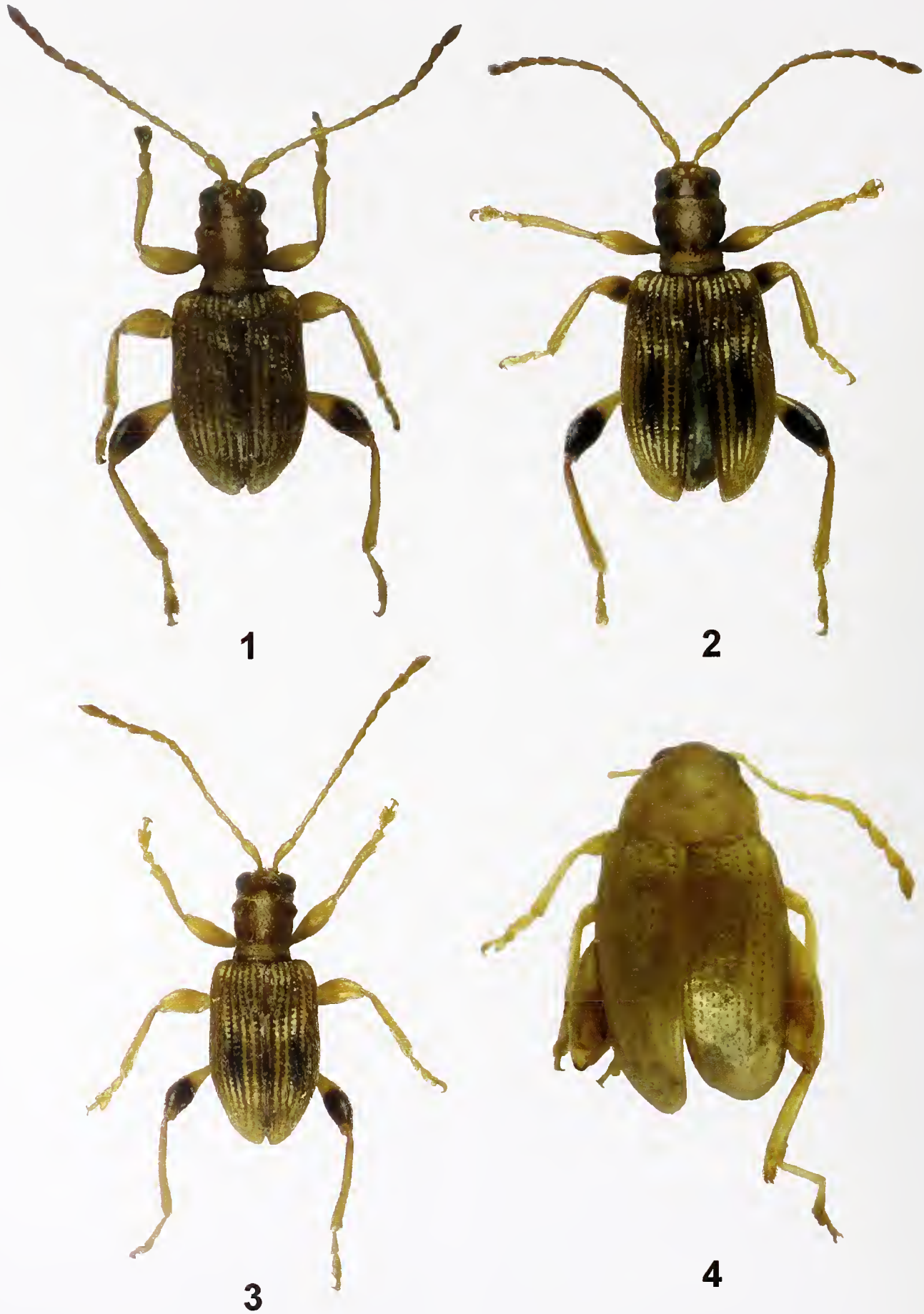
Figs 1–4. 1–3. Lipromorpha alutacea sp. n. 1. male, Hsitou; 2. female, Tengchih; 3. male, Tengchih. 4. Psylliodes palleola Motschulsky, lectotype.