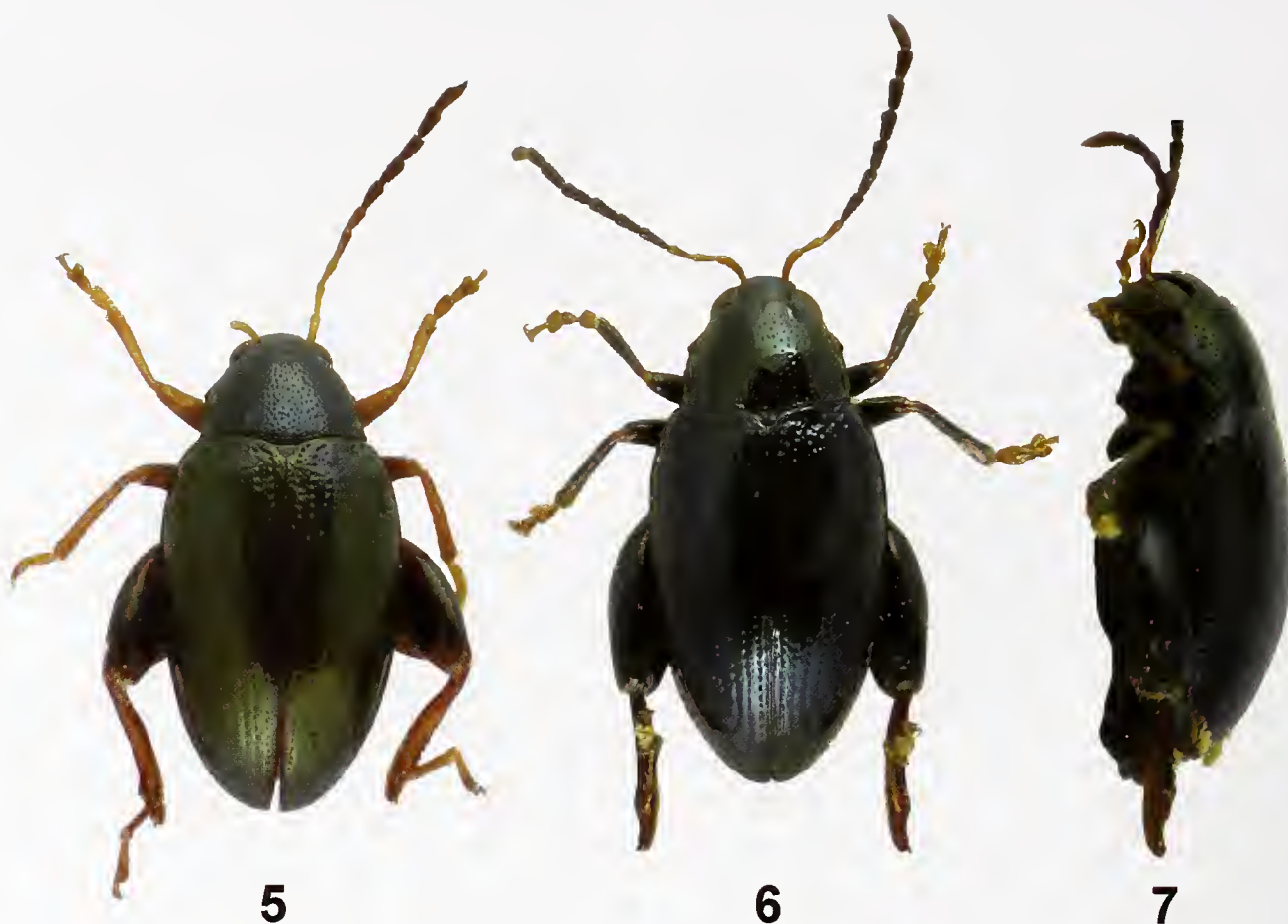
Figs 5–7. 5. Psylliodes viridana Motschulsky: lectotype; 6–7. Psylliodes yuae sp. n.: 6. dorsal view; 7. lateral view.

16.VII.2007, leg. M.-H. Tsau, 1 ex. (TARI). Hsinchu County , Taiwan: Hsinchu, Talulintao, 17.II.2008, leg. M.-H. Tsao, 12 exx. (TARI); Taiwan: Hsinchu, Feifengshan, 05.III.2009, leg. S.-F. Yu, 6 exx. (TARI); Taiwan: Hsinchu, Hsinfeng, 31.III.2009, leg. S.-F. Yu, 4 exx. (TARI); Taiwan: Hsinchu, Wufeng, 17.II.2009, leg. S.-F. Yu, 1 ex. (TARI); Taiwan: Hsinchu, Paoerhshuiku, 04.XII.2008, leg. S.-F. Yu, 1 ex. (TARI).