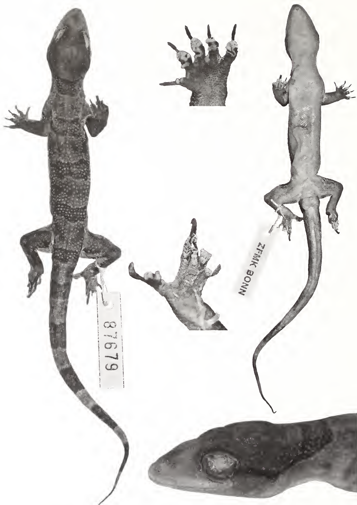
Fig. 4. The holotype (ZFMK 87679) of Hemidactylus coalescens sp. n.