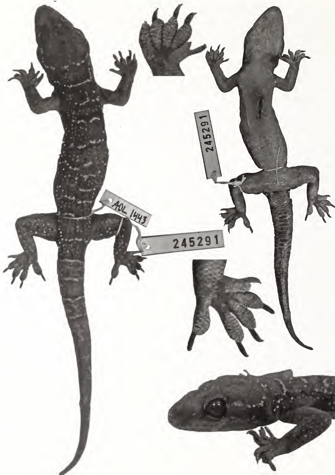
Fig. 2. The holotype of (MVZ 245291) Hemidactylus kyaboboensis sp. n.