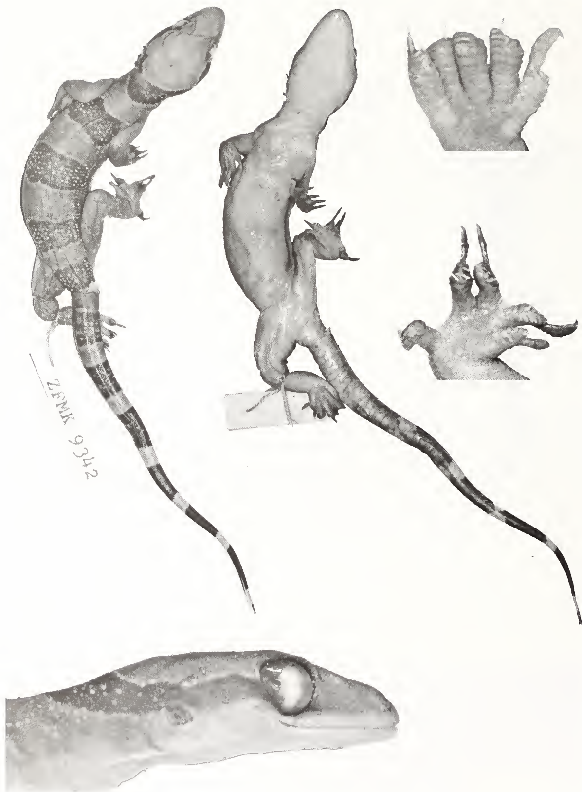
Fig. 5. The holotype (ZFMK 9342) of Hemidactylus biokoensis sp. n.