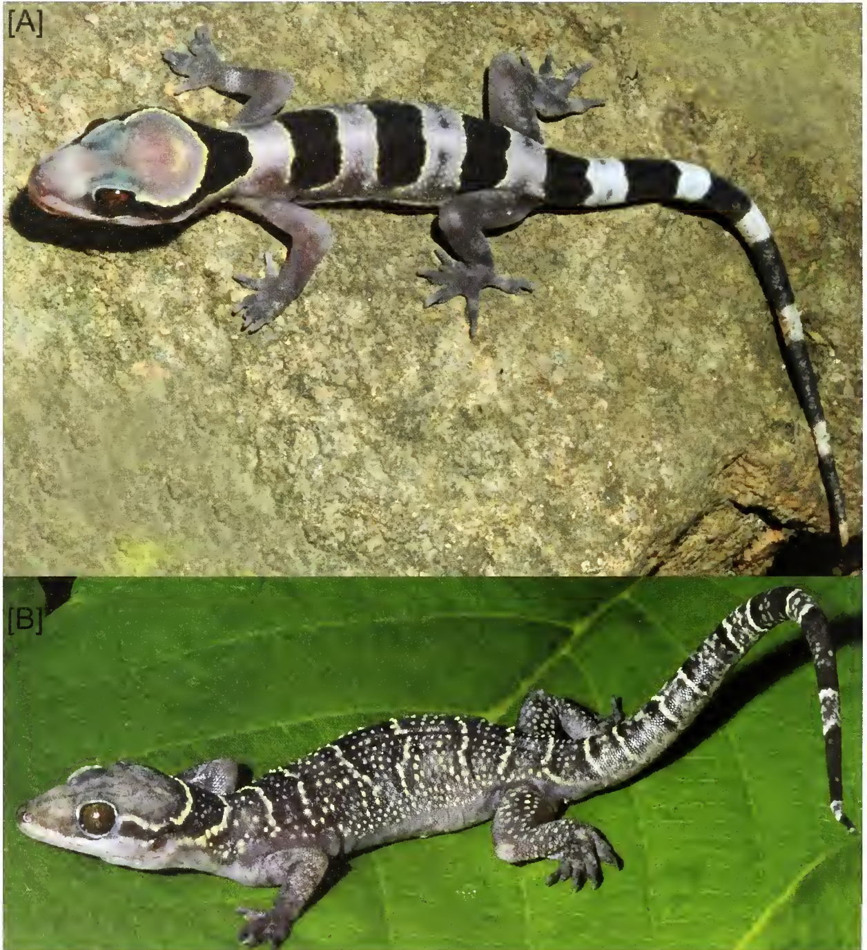
Fig. 1. [A] Living specimen of Hemidactylus fasciatus (not collected) from Liberia; [B] Living specimen of Hemidactylus kyaboboensis sp. n. from the type locality.

lus species, and is therefore not compared to them in the present study.