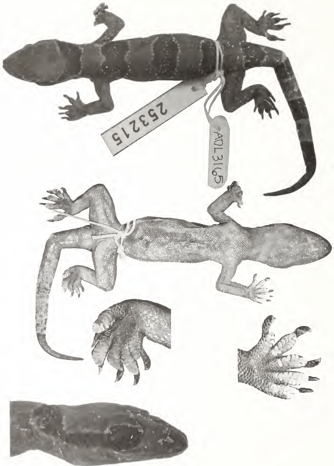
Fig. 3. The holotype (MVZ 253215) of Hemidactylus eniangii sp. n.