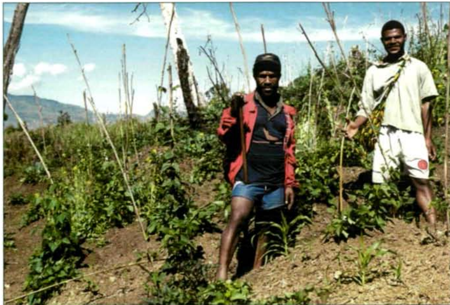
Fig. 1. Village garden with sweet potato, beans and local greens; author of the article on the right.

Tabare Sine, where I live, is an area in the Highlands of Papua New Guinea, inhabited by people speaking their own Tabare Sine language. Traditionally, we use to hunt animals in the forest and make gardens planted with sweet potato, greens, sugar cane and bananas (Fig. 1). We live in small villages surrounded by