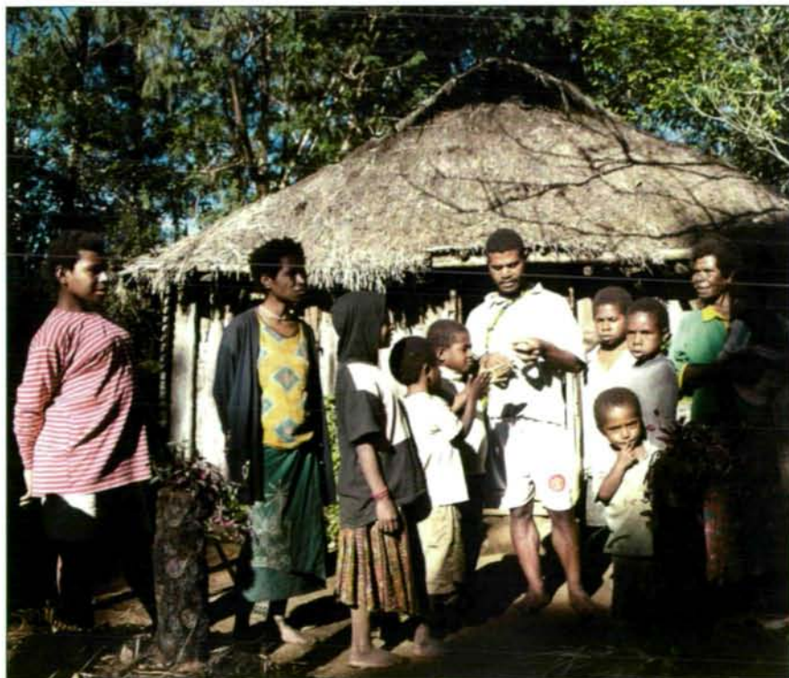
Fig. 2. Village house in Tabare Sine

grasslands and rainforests where we make our gardens. Our houses are built from timber (mostly Casuarina and Notophagus ). They have no windows, floor and roof is covered with grass and there is a fireplace in the middle of the house, for heating and cooking (Fig. 2).