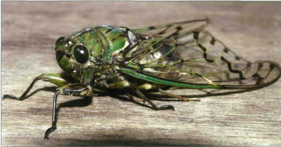
Fig. 3. Dui boh ( Cosmopsaltria mimica ) has a pleasant taste

Cicadas are also helping hunters to time their hunting activities in the forest (Fig. 4). When they hear Dui boh in the afternoon, they start their preparations for hunting. When Dui erangrre sings, the hunters know that cuscus and other forest animals leave their hiding places and start looking for food in the forest. At the time when Dui wawe sings, we use to say „noge kobil kemue“ or