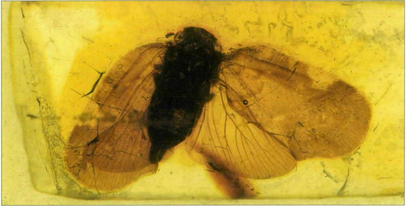
Fig. 1: Acroprivesa msandarusi sp. nov.

Etymology. Species name from the Suahili word 'msandarusi' – gum copal tree ( Hymenaea verrucosa ).