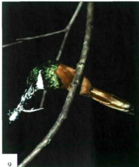
Fig. 9: Black-chinned Jacamar with Pterodictya reticularis , Costa Rica.