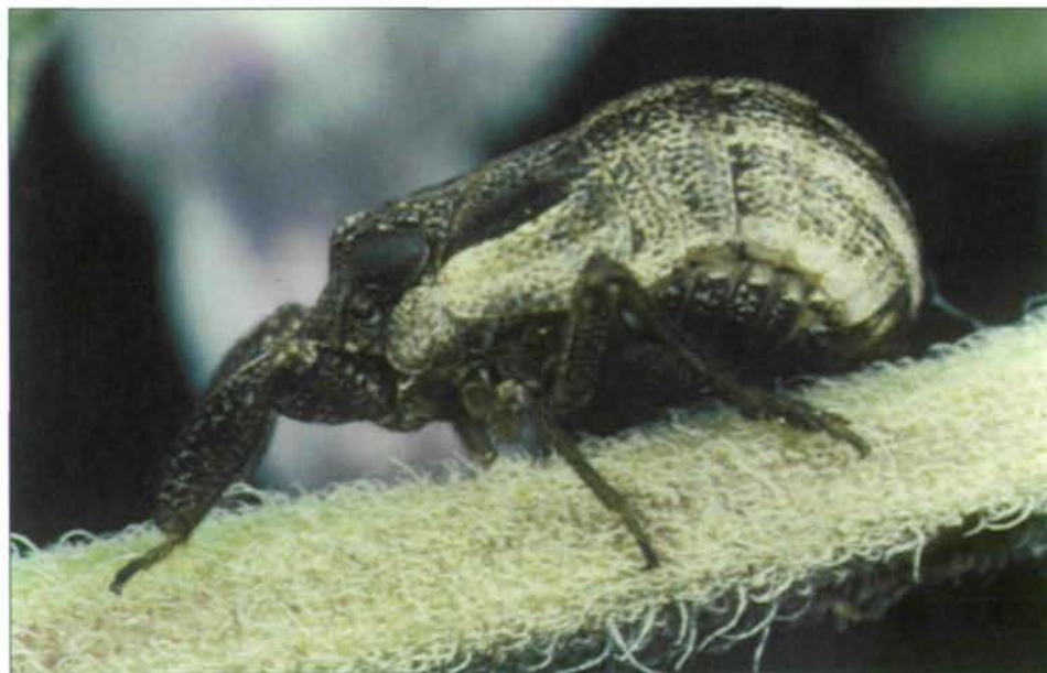
Fig. 23: Caliscelis bonellii LATREILLE, female, France.