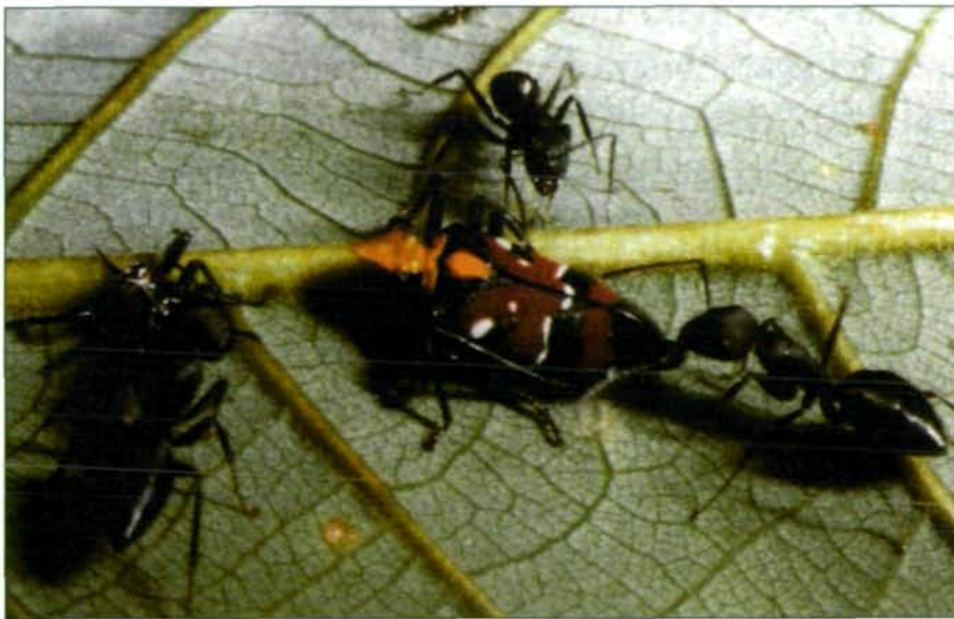
Fig. 25: Euphyonarthex phyllostoma with ants Camponotus acvapimensis .

Tripiduchids are common in the West Indies, and have been found in the Dominican amber. In the West Indies, the number of Fulgoromorpha specimens is a much higher percentage of the insect population than it is on the mainland. This is also reflected in the Dominican amber, although nymphs are even more common than adults in the amber (see SZWEDO, in this volume).