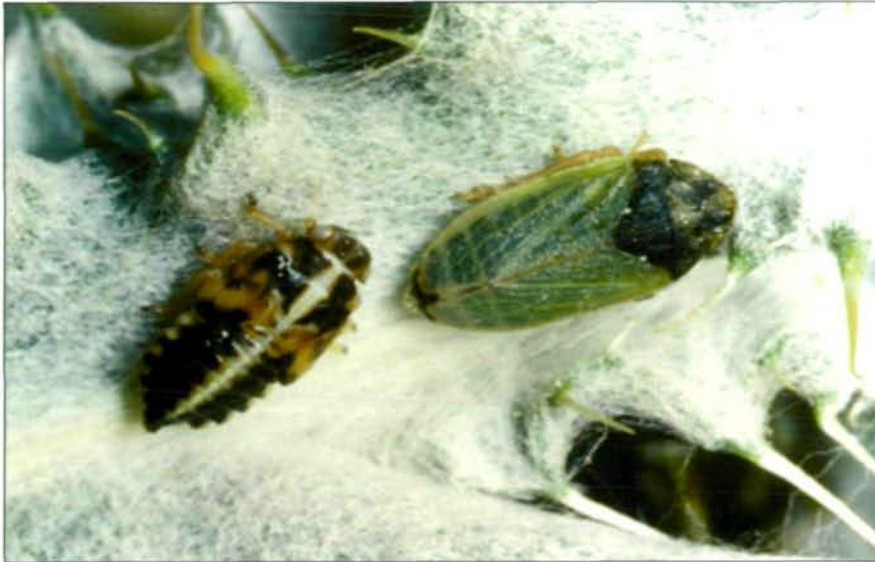
Fig. 24: Tettigometra sulphurea , imago and nymph.

a transverse groove. Their idiosyncrasies are oddly shaped heads, variable wing patterns, and red carinae or color patterns thrown in every now and then. They are found on ferns, palms, grasses and dicots. The Dubas bug ( Dubas means honeydew in Arabic), Ommatissus lybicus , is the greatest pest of date palms in the middle east and can cause the death of trees (ASCHE & WILSON 1989).