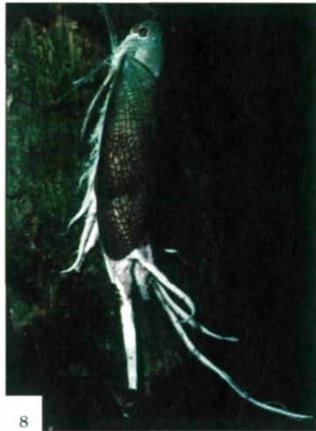
Fig. 8: Pterodictya reticularis OLIVIER, Ecuador.