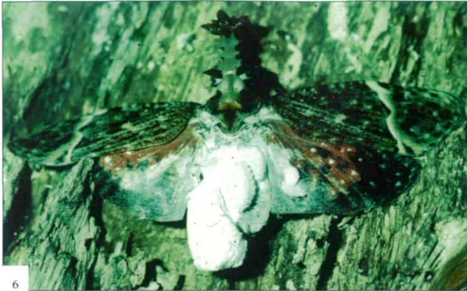
Fig. 6: Phrictus tripartitus METCALF with parasitic Epiphyropidae, Panama.