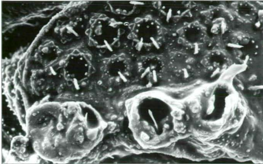
Fig. 15: SEM Photo of wax pores on a wax plate of a flatid, N.Z.

Their nymphs feed on roots underground, and some found themselves in caves and eventually evolved to eyeless, sometimes wingless,