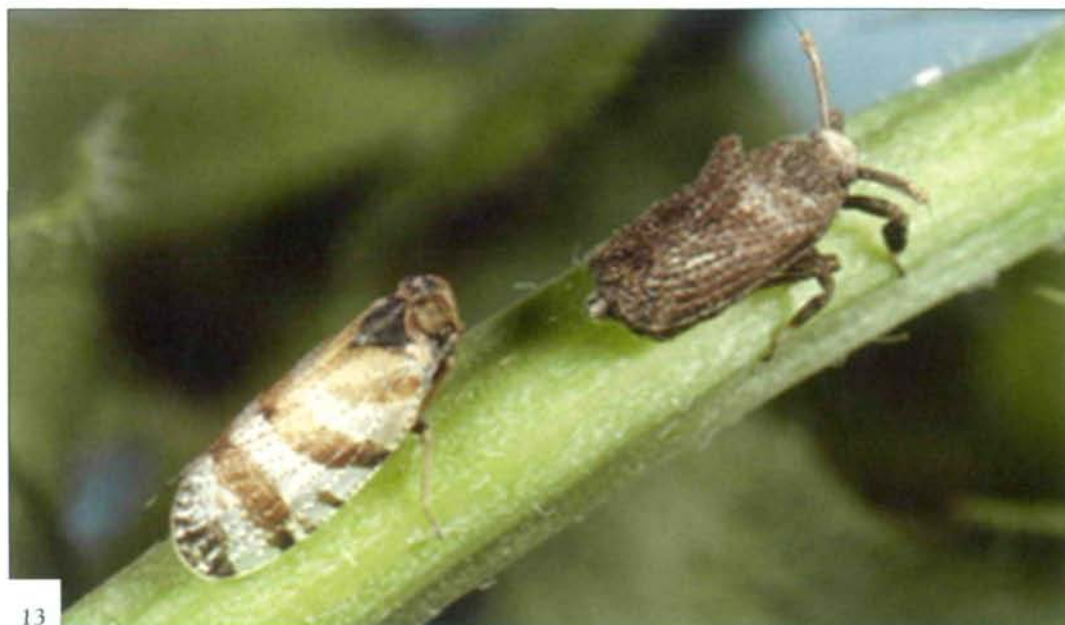
Fig. 13: Tachycixius venustus (Cixiidae; left) and Asiraca clavicornis (Delphacidae; right) on a green twig, France.

"Love songs from Paradise", Since I, as a female, want the human race to be a tie, I'm happy to work on a group in which the females can sing, too. I've always been annoyed by Aristotle's witticism, "Happy are cicada's lives, for always silent are their wives!" Ugggh. Do you know of any other animal, except people at a sporting event, that can be so loud for so long?