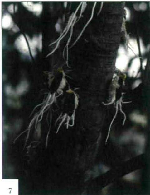
Fig. 7: Cerogenes auricoma BURMEISTER, Mexico.