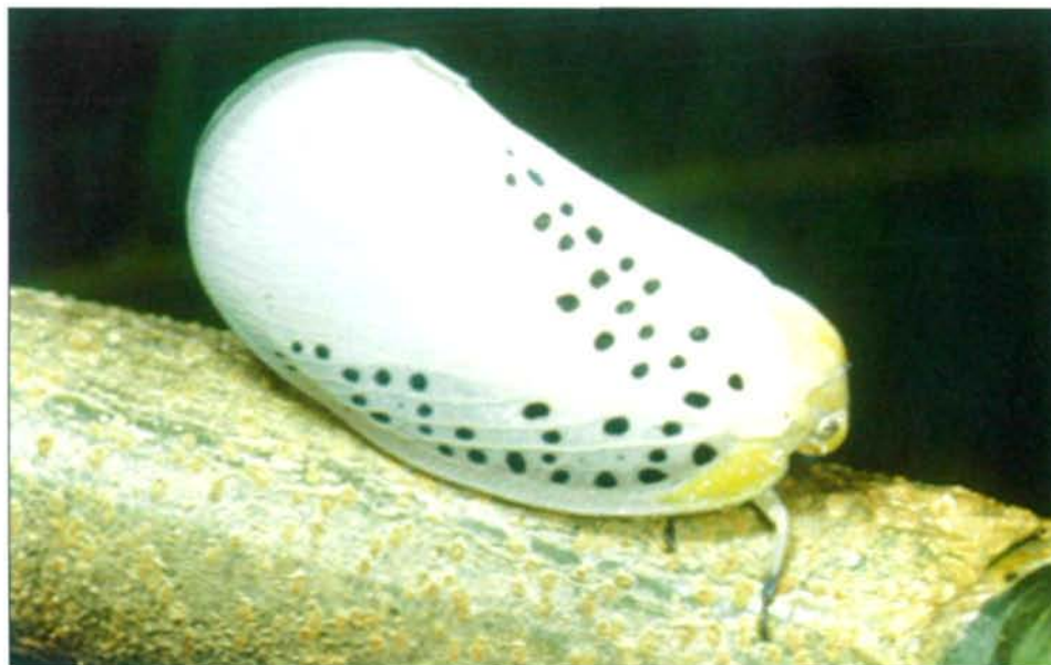
Fig. 26: Poekilloptera phalaenoides . © Photo: M. Boulard

One U. S. flatid, Metcalfa pruinosa (SAY) has somehow been introduced into Italy from which it is spreading to the rest of southern Europe. It is not a severe pest in the U. S., although it feeds on at least 100 species of plants here. But it has had a population explosion in Europe without the predators and parasites found in the U. S. (see ALMA, in this volume). The wax it produces covers the produce, most-