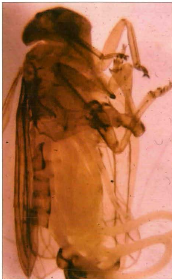
Fig. 21: Thionia simplex with nematode, issid 6.5 mm; nematode 69mm.

Fulgoromorpha can be parasitized in all stages by other insects. In the case of this issid, a nematode was the parasite. This host (fig. 21) was 6.5 mm long, the nematode 69 mm long!