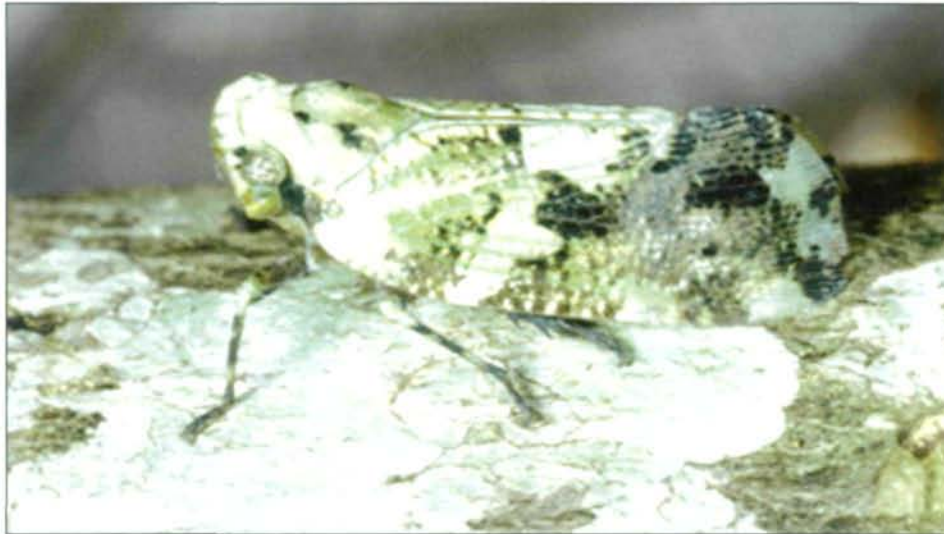
Fig. 30: Mesonitys taeniata SCHMIDT.