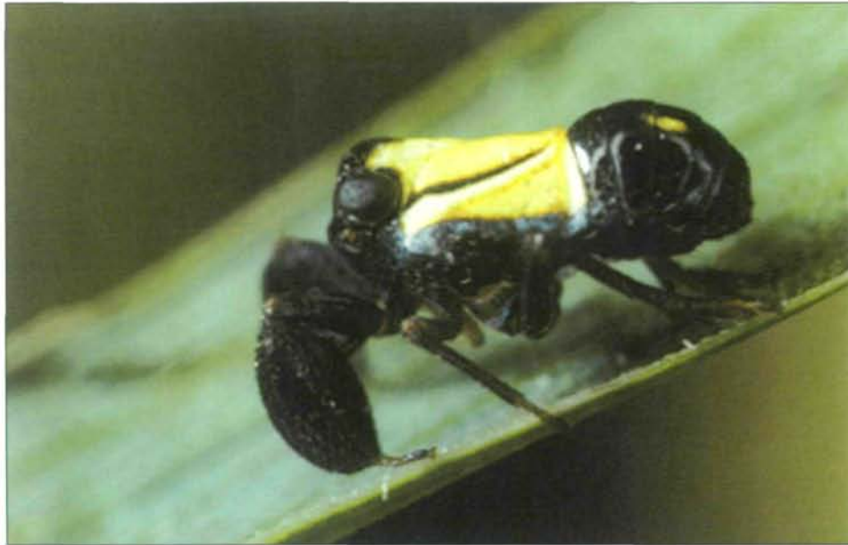
Fig. 22: Caliscelis bonellii LATREILLE, male, France.

the Issidae to the Nogodinidae, changing the characterization so that it is easier to identify a specimen to tribe and then see which family the tribe is in than to identify a specimen to family and then tribe, because each family has very distinctive groups that do not resemble each other. A key for the identification of Nogodinids, Issids and related families is provided by EMEJANOV (1999).