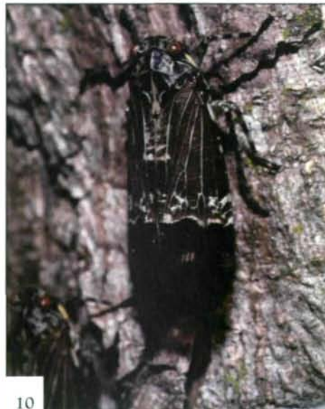
Fig. 10: Hypaepa illuminata , Honduras.