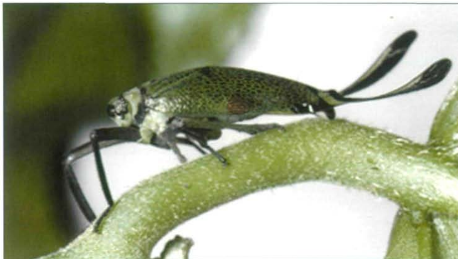
Fig. 31: Harmosa bivulneratum .

and the hind wings have an elongation that looks like a beak. Five species can be arranged in a heuristic sequence that more and more closely resembles the weevils in color, shape of thorax, angle of sitting on the plant. A second genus from Africa, Harmosa , (fig. 31) has the "antennae" extended from the forewing (but no clear eye spot), and the hind wing extended to appear to be a head below the antennae.