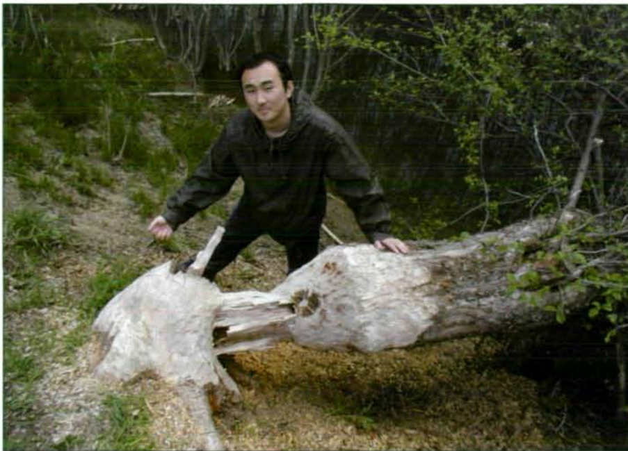
Fig. 3: In many situations tourists generate more money than beaver do damages.

ecological benefits of 1 ha of wetlands is estimated to be around 10.000,- Euro per year (CONSTANZA et al. 1989). To date 170.000.000,- Euro of ecological value has already been generated by beavers in Poland. In addition, wetlands are sponges and kidneys that store and purify water. Poland needs this service – it is among the countries in Europe with the poorest quality drinking water and surface water. Respondents also showed an interest in improving the potential for tourism in their areas. Beaver-created wetlands are fascinating habitats that have great potential in this regard. In Maine, USA, Japanese tourists have