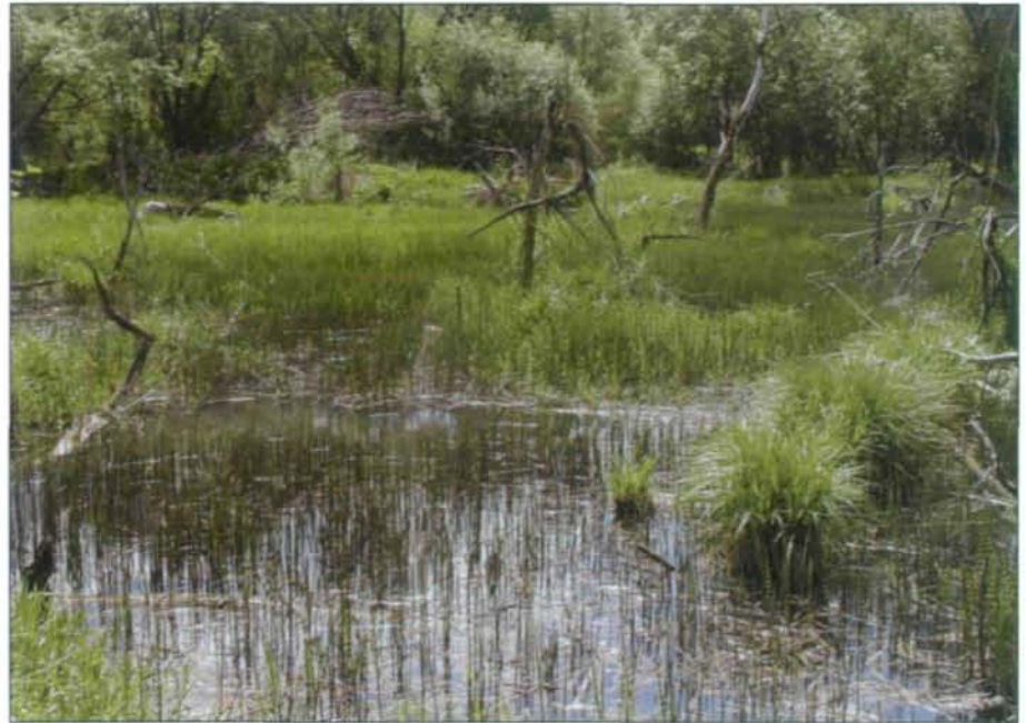
Fig. 1: Wetland maintained by family of beavers for 15 years.

Our research provides the first data on the broad scale influence of beavers in Poland. The area of beaver-created wetlands was around 17.000 hectares in 2002. Wet-