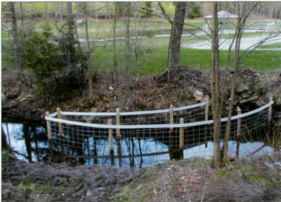
Fig. 4: Beaver deceiver built in Vermont, USA.

Attitudes towards beavers often exacerbate conflicts. Human perceptions of history and how the land is “supposed to be” frequently do not include the presence of beavers. Throughout most of history beavers had a significant influence on European ecosystems. Through cutting trees and dam building they modified the morphology and hydrology of streams and rivers. But when beavers were destroyed the wetland ecosystems that they maintained for millennia disappeared from the landscape for hundreds if not thousands of years. Consequently, we have forgotten how natural, native aquatic ecosystems are supposed to look. Beavers are symbolic of the loss of contact between modern humans and nature. Legal protection at the beginning of the 20 th century saved the species, but beaver numbers today are only a small fraction of their previous grandeur. Beavers are still treated as a curiosity. And when conflicts arise, we often have little patience with this apparent invader – largely unknown to our experience or to that of our parent’s – that wishes to change a tiny percentage of the landscape from a relatively sterile condition back into