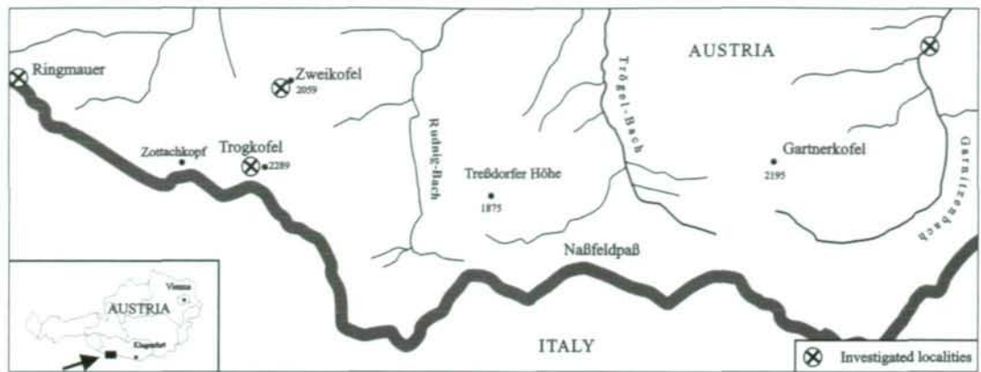
Fig. 1: Location of investigated profiles in Carnic Alps, Austria.