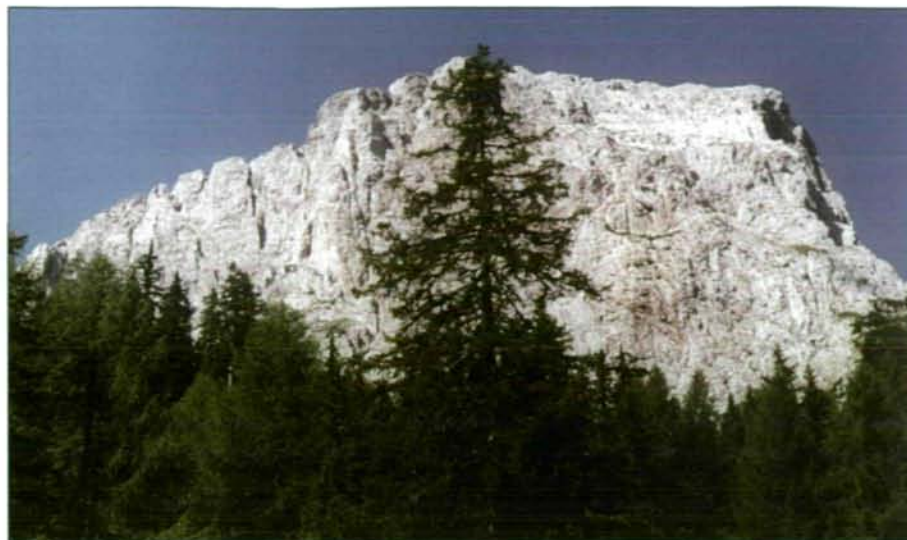
Fig. 5: Locality Trogkofel outcropping rocks of the Trogkofel Formation (Lower Permian, Sakmarian – Artinskian).

6f-g), Penniretepora trapezoida NIKIFIROVA 1938, Penniretepora spp., Alternifenestella subquadrata SCHULGA-NESTERENKO 1952, A. tuberculifera SCHULGA-NESTERENKO 1952 (Fig. 6m), Polypora sigillata GORJUNOVA 1975, Paraptylopora sp. (Fig. 6h), Carnocladia fasciculata ERNST 2001 (Fig. 6i), and C. punctata ERNST 2001.