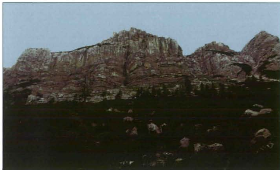
Fig. 4: Locality Zweikofel outcropping rocks of the Upper Pseudoschwagerina Formation (Lower Permian, Sakmarian).